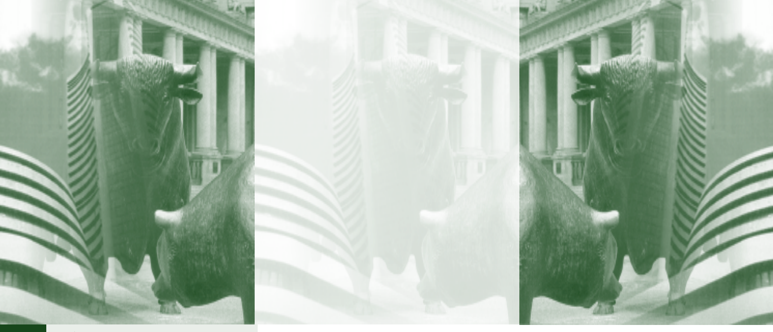
SECTION 5 : REVIEW OF BUSINESS