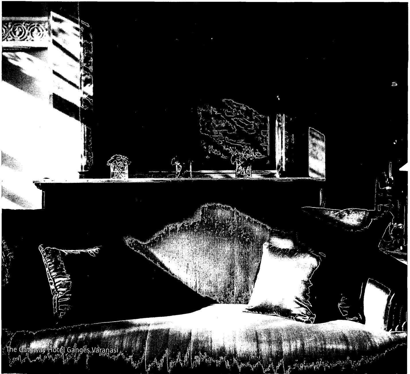
The Gateway Hotel Ganges Varanasi