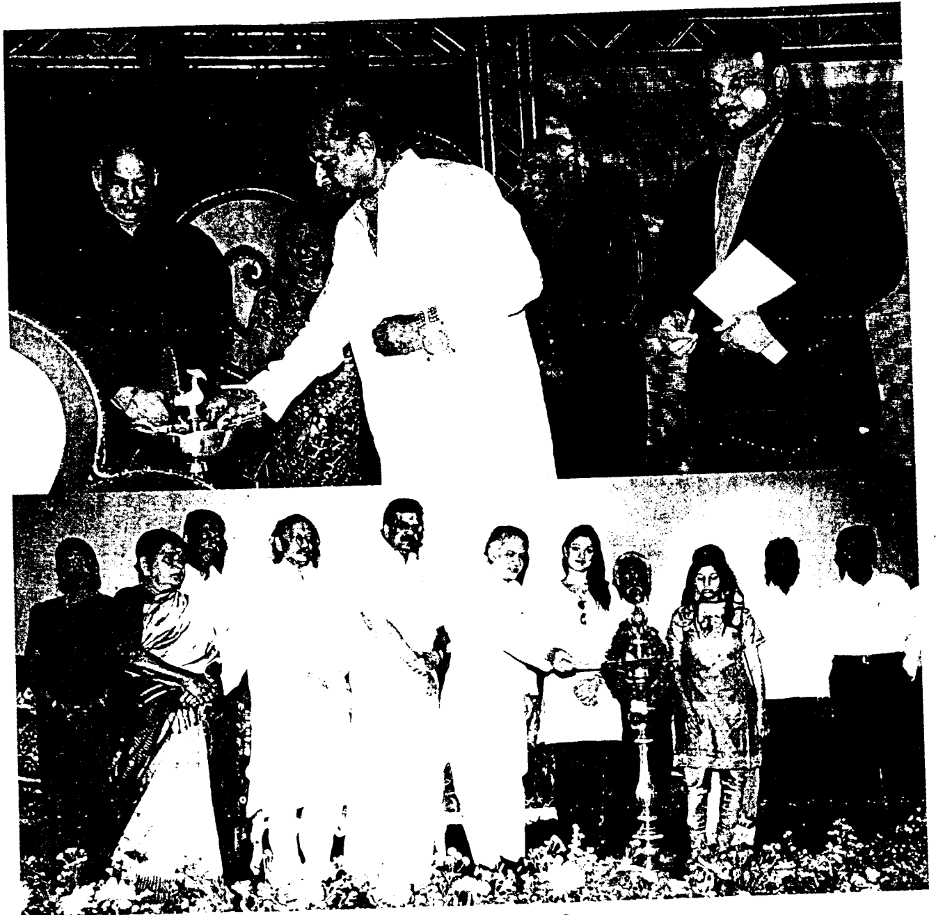
Tanjore Theatre Opening Ceremony