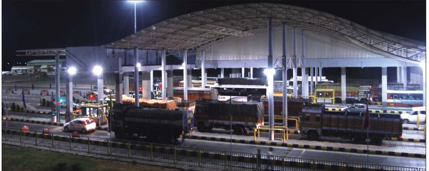
Toll Plaza - Dhule Pimpalgaon Project.

Your Company has pledged its present shareholding and has committed pledging of future shareholding in ISTPL in connection with a term loan of ₹ 4500 million taken by ISTPL from 8 banks, State Bank of India being the lead bank lender.