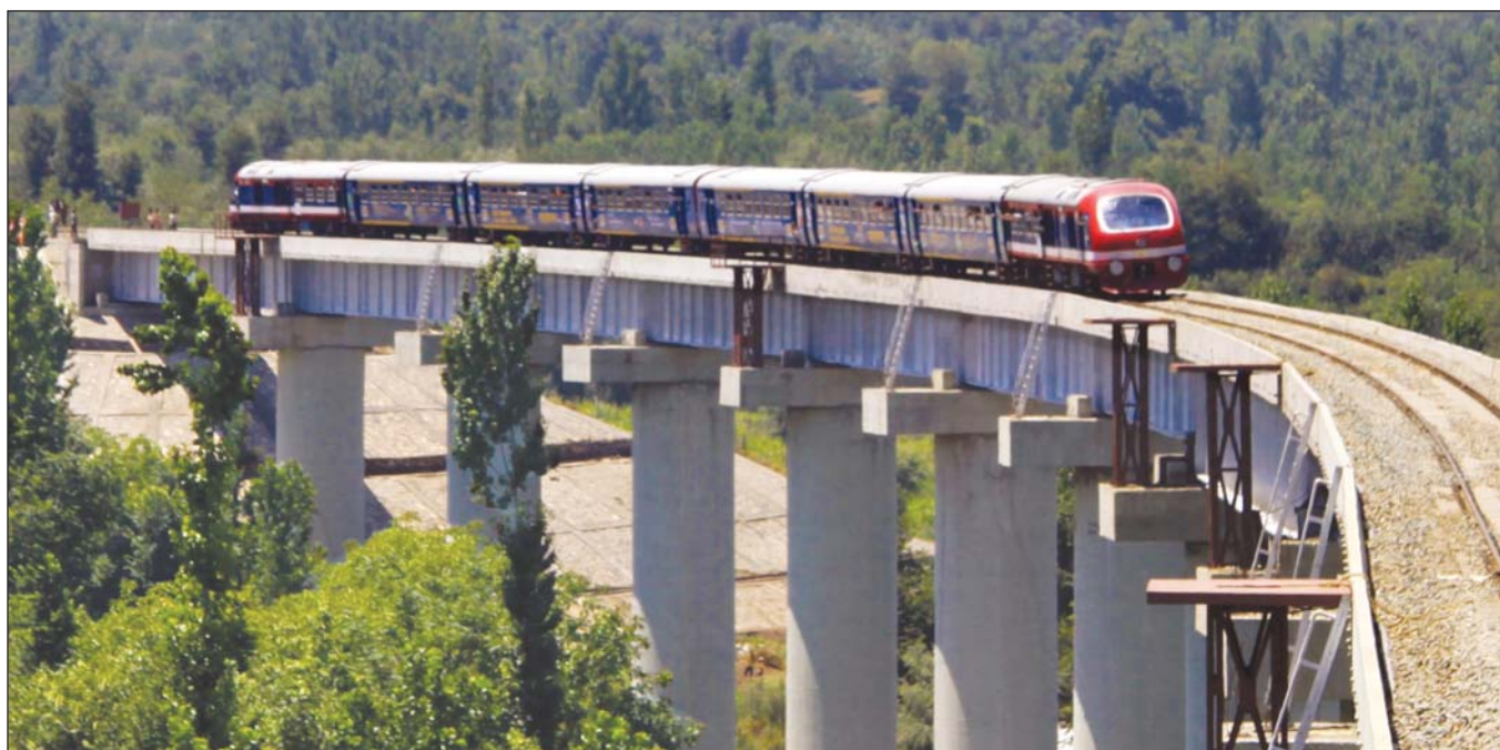
Diesel Multiple Unit on run J&K Project.