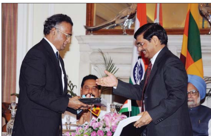
Signing of agreement by MD, Iicon in presence of President of Sri Lanka and Prime Minister of India

After the close of the year , your Company has signed in June 2010 a contract agreement with Government of Sri Lanka for restoration of railway line from Madhu Road to Talai Mannar, at a total value of USD 149.74 million. The contract will come into operation only after signing of loan agreement between EXIM Bank of India and Government of Sri Lanka.