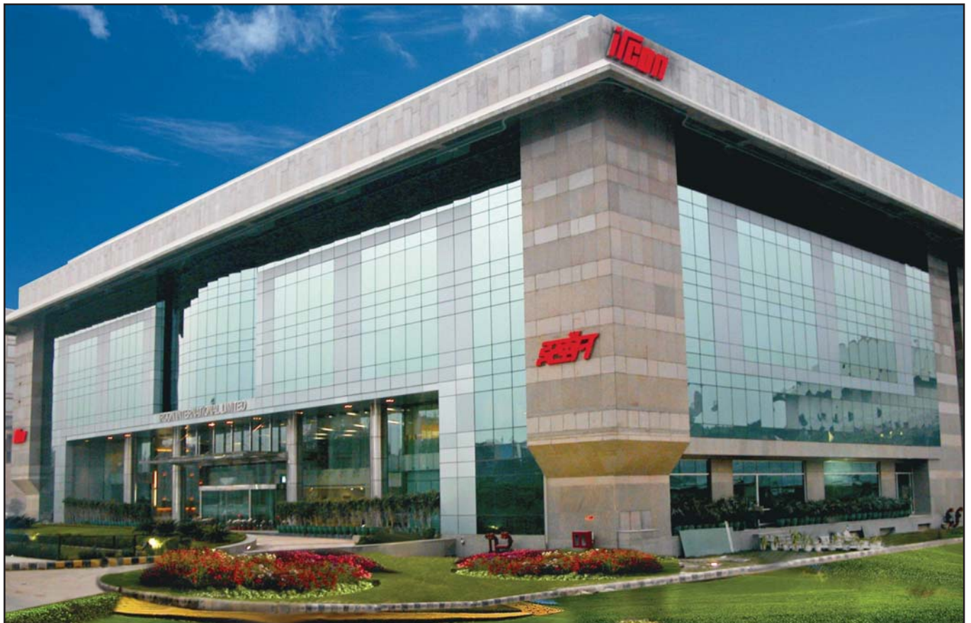
Corporate Office Building of Irrcon at Saket, New Delhi

Delhi Stock Exchange Limited, DSE House, 3/1, Asaf Ali Road, New Delhi-110002