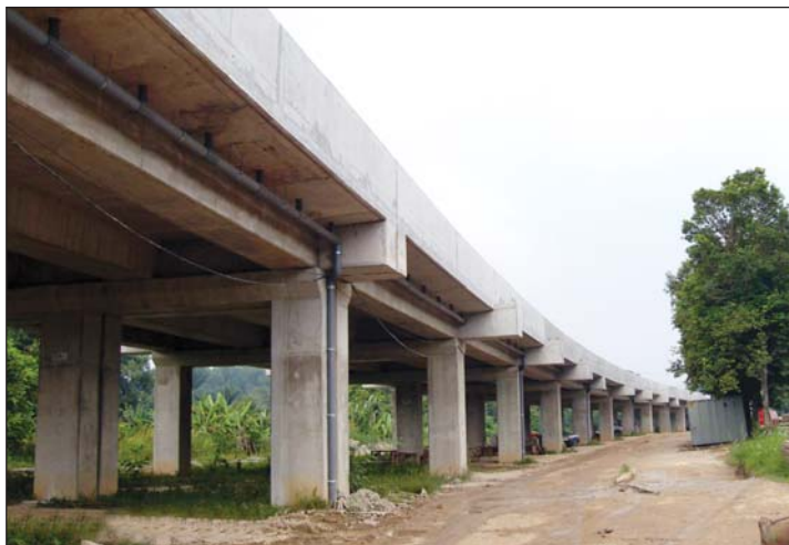
Viaduct - Malaysia Project