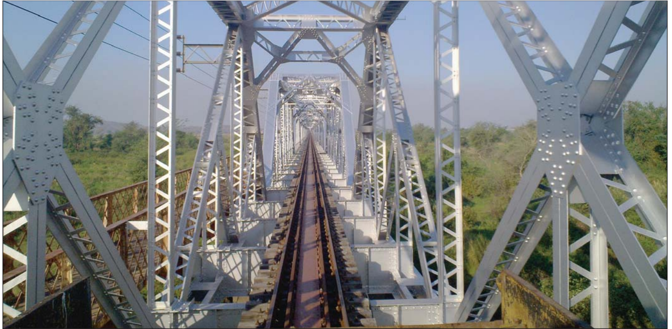
Rehabilitation of DONA ANA Bridge in Mozambique.