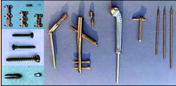
Manufacture of Bio - Implants towards human cause

manufacture and supply of Bio-medical implants to the needy at highly affordable prices when compared to imports. Such supplies amounted to Rs. 27 lakhs during the year under report which include 70 Nos of custom made prosthesis to Cancer patients.