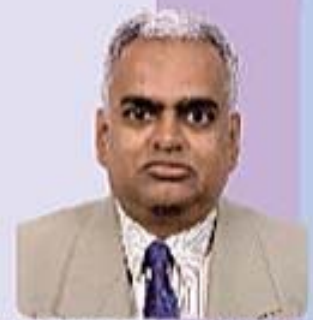
(CEO - Nashik Plant)