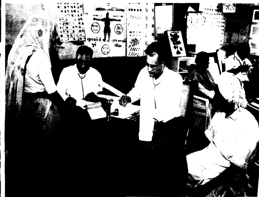
Medical Camp at Ekalbara