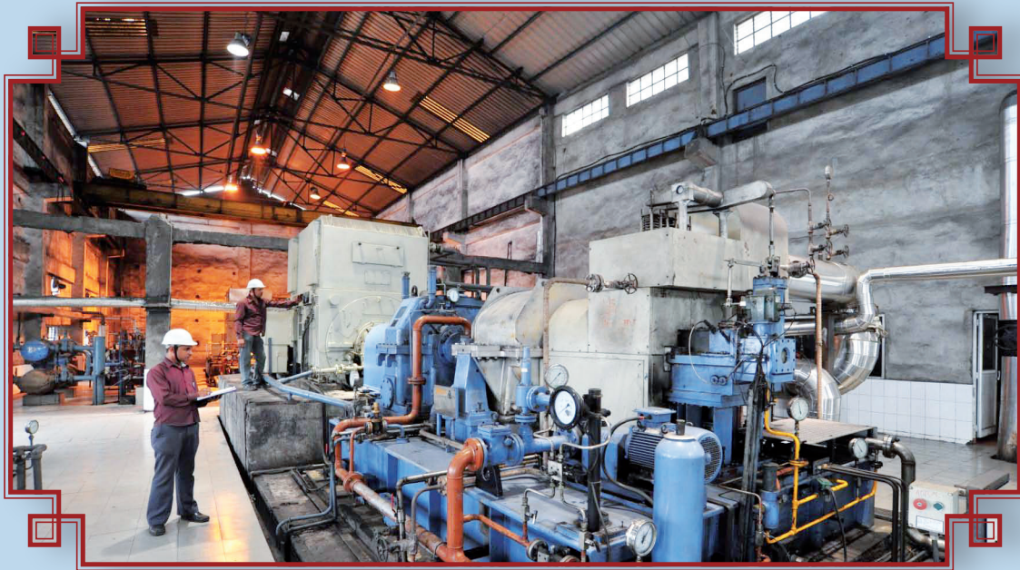
Power Plant in Raipur