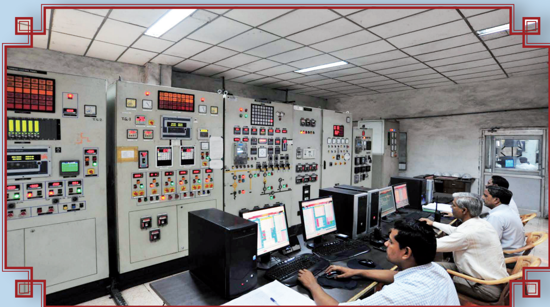
Control room for power plant in Raipur