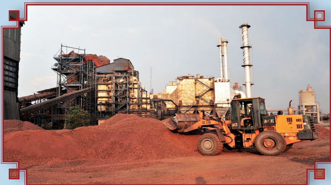
Iron ore used as Raw Material for Manufacturing of Sponge Iron