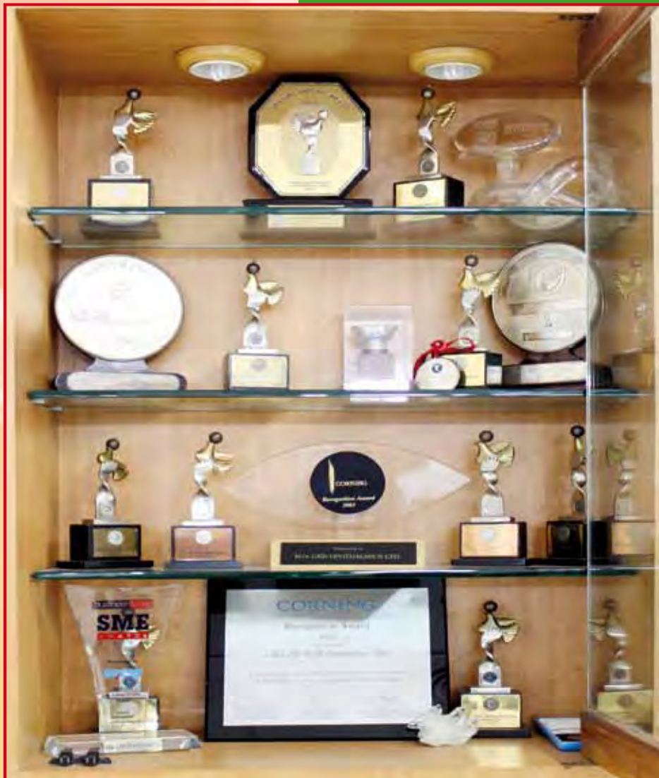
Recognition & Awards