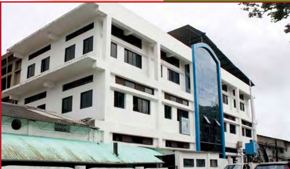
New building for manufacture of plastic lenses