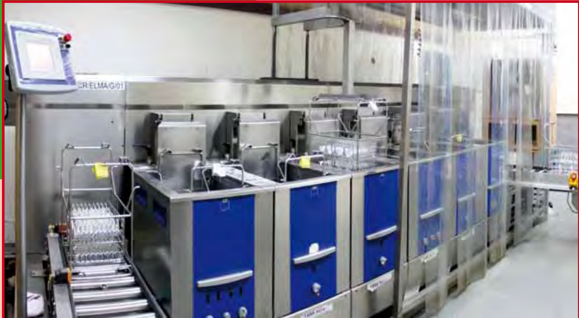
Automatic washing and cleaning machine