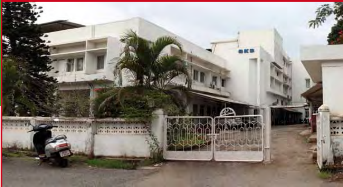
Main building of the Company