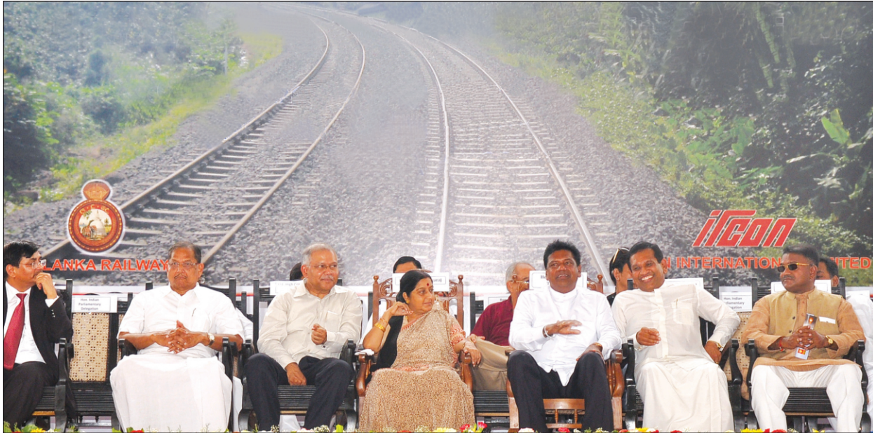
Commissioning of Upgraded Railway Track Kalutara - Galle - Matara Section

Phase-I of the project (Galle – Matara section) valued at USD 36.24 million got completed and passenger traffic was commenced on this section from 16 th February 2011. The work on phase II (Kalutara – Galle) (at a value of USD 41.26 million) was taken up in October 2010. One section from Galle to Hikkaduwa was completed and opened for passenger traffic during the year on 19 th January 2012. The work in the balance section (Hikkaduwa to Kalutara) has also been completed and the section has been opened for passenger traffic on 19 th April 2012.