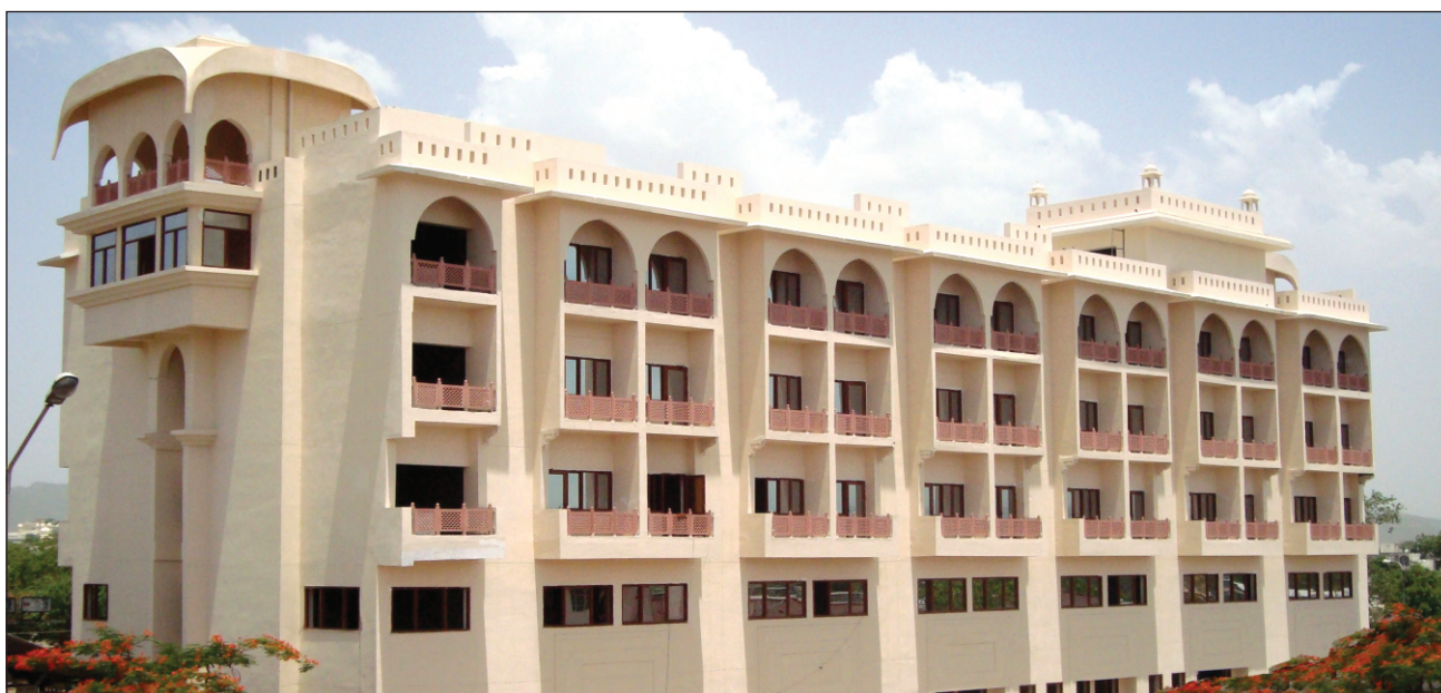
Multi Functional Complex at Udaipur

IrconISL also secured a project of Ministry of External Affairs for providing Consultancy Services for "Design Review and Re-Design of road section from Kaletwa to India-Myanmar border as per NH standards" at a total price of approximately ₹ 3 crores. IrconISL is also implementing identified projects of Corporate Social Responsibility of Ircon.