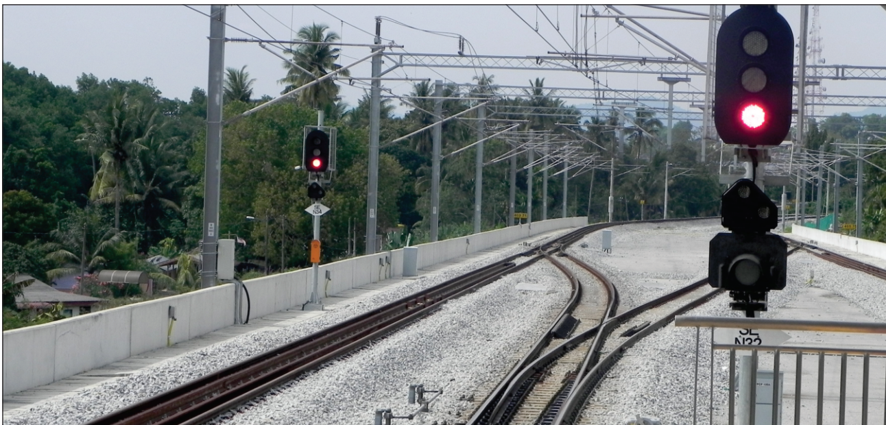
Sungai Gadut Yard - Ph-I of Seremban Gemas Double Tracking Project, Malaysia