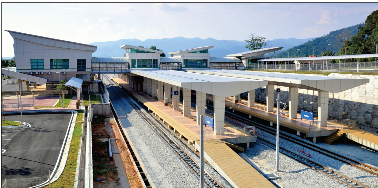
Rembau Station Building of Seremban-Gemas Electrified Double Track Project, Malaysia