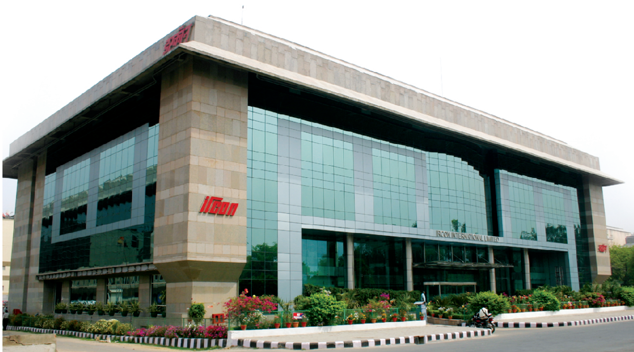
Corporate Office Building of Ircon at Saket, New Delhi

Wahi & Gupta, Chartered Accountants, Hotel Rex Building (OBC Building), 5, Netaji Subhash Marg, Daryaganj, New Delhi-110002