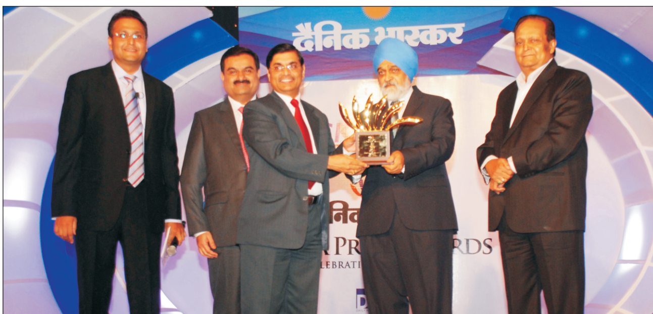
India Pride Award being presented to M.D., IRCON