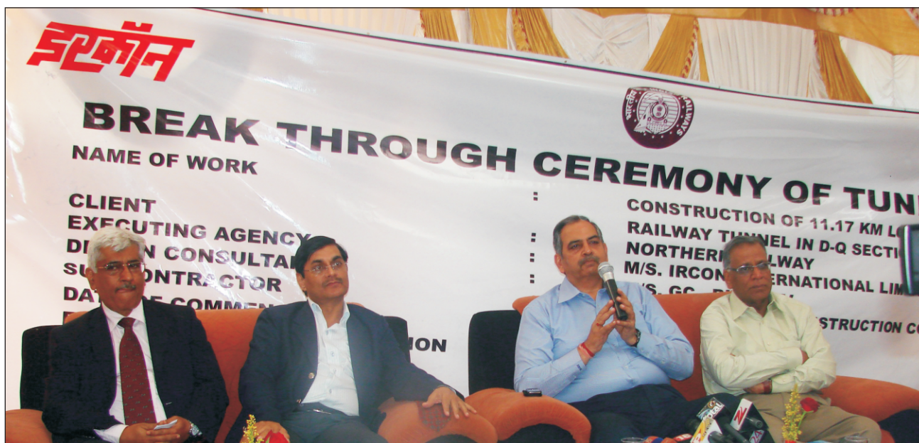
Breakthrough Ceremony of Tunnel T-80 (Pir Panjal Tunnel) J&K Rail Link Project