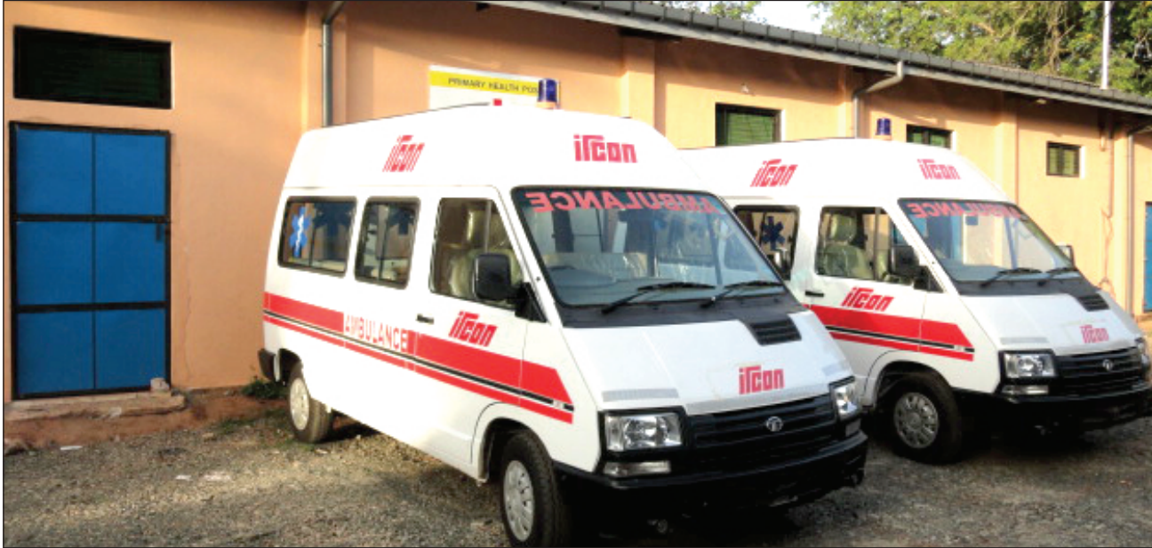
Health Unit Maintained at Medawachchiya in Sri Lanka under CSR Scheme

Your Company has a CSR Policy matching with its long term business plan in tune with CSR Guidelines issued by the Department of Public Enterprises.