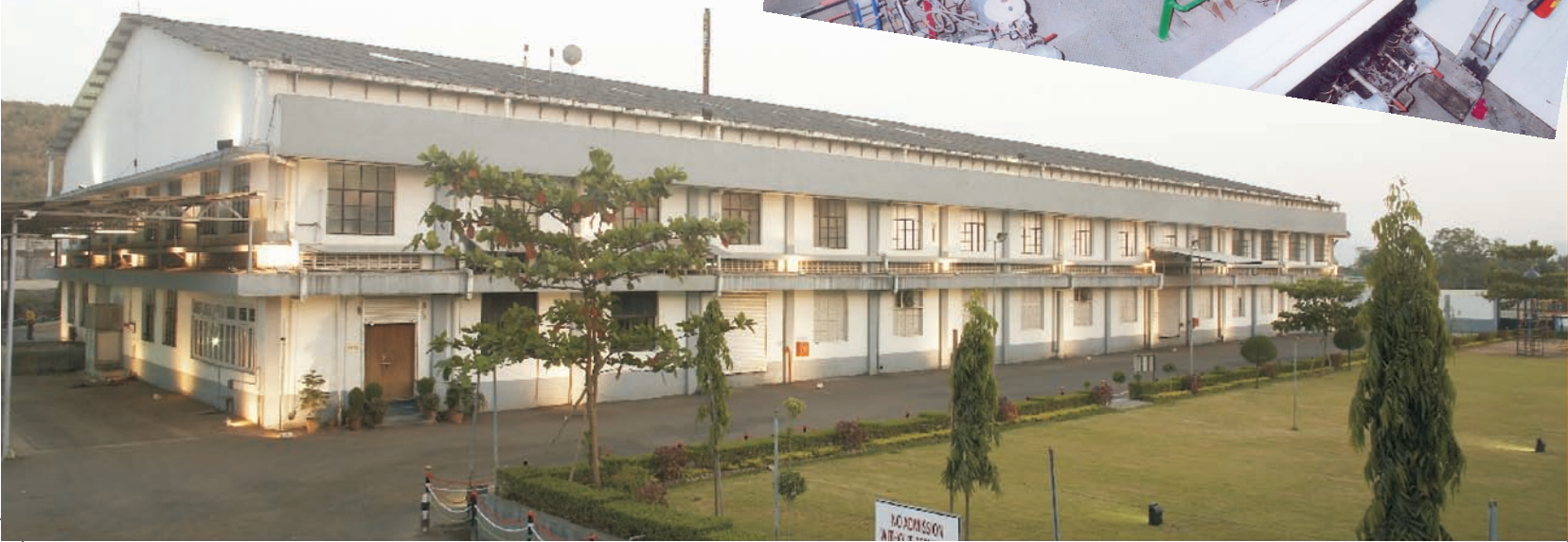
ROML Factory - Manor