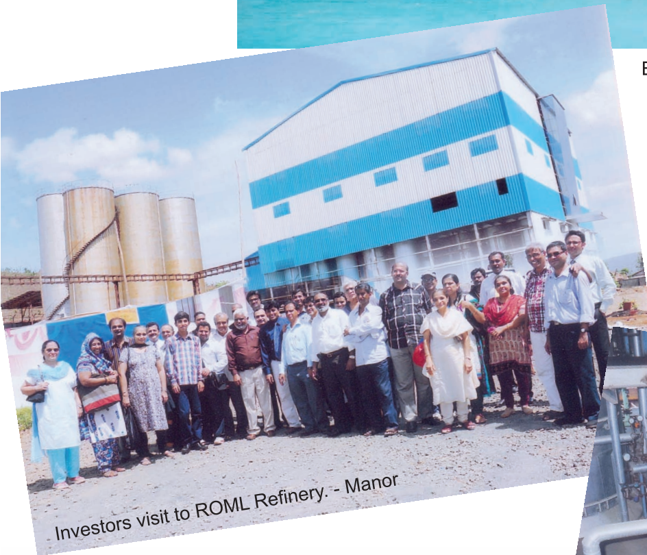
Investors visit to ROML Refinery. - Manor