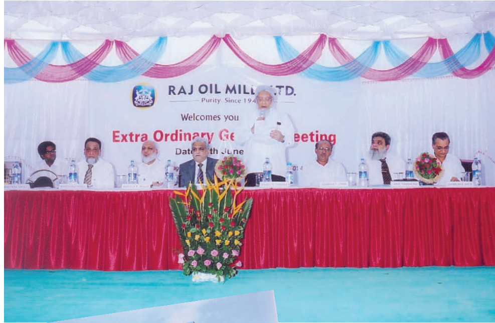
Extra Ordinary General Meeting Manor - 4th June, 2012