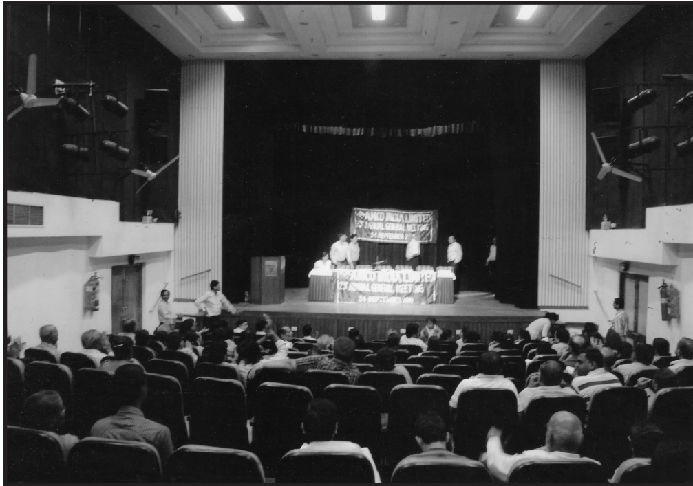
Board of Amco India Limited coming on dias & respected Shareholders at the 23rd Annual General Meeting held on 24.09.2010