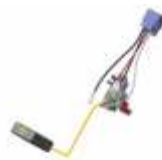
Fuel Level Sensor