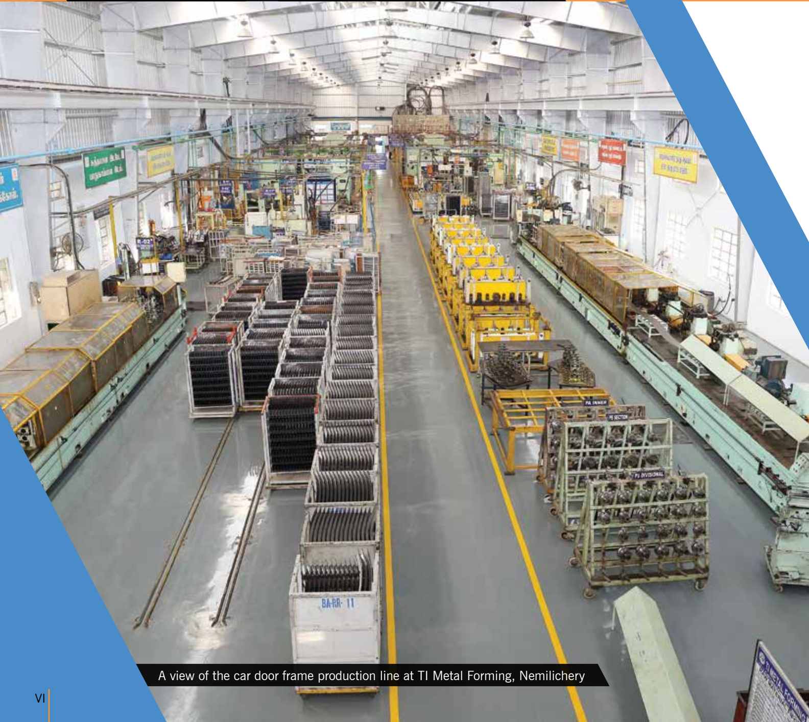
A view of the car door frame production line at TI Metal Forming, Nemilichery