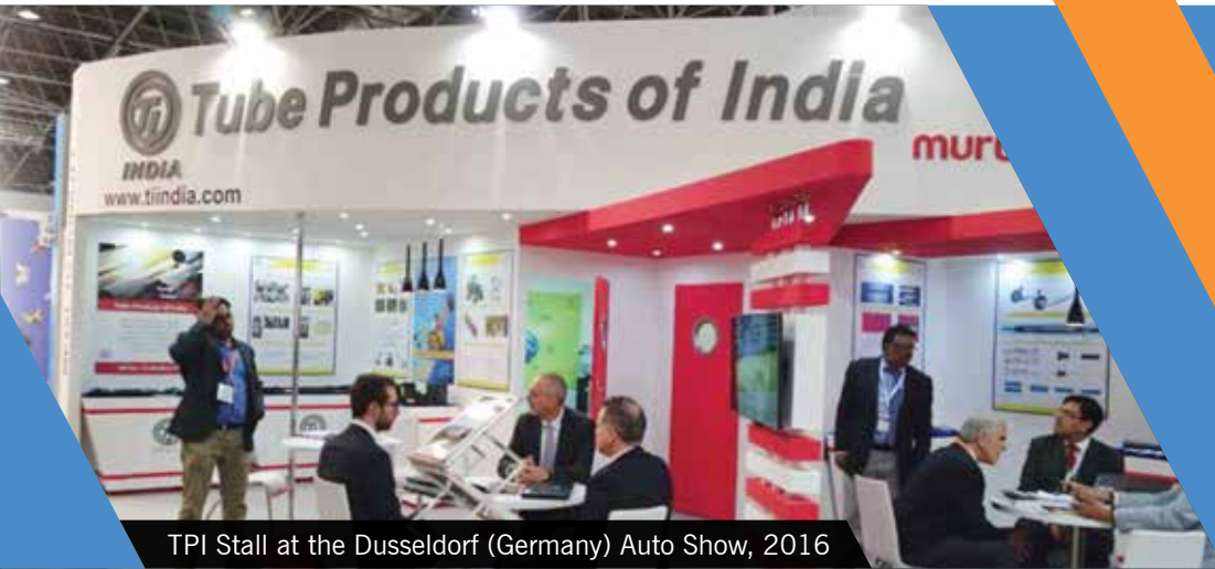
TPI Stall at the Dusseldorf (Germany) Auto Show, 2016