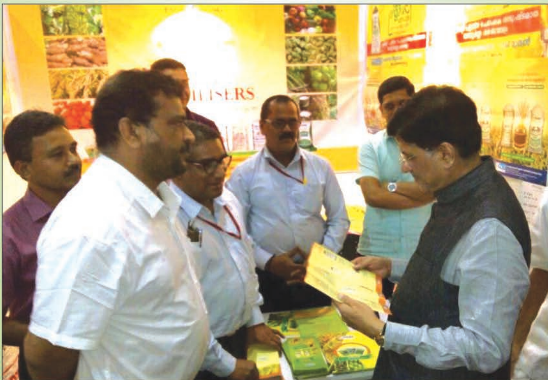
Shri Piyush Goyal, Minister of State for Power, Coal and New and Renewable Energy and Mines, visits FACT exhibition stall at CIAL Trade Fair and Exhibition Centre, Nedumbassery held in connection with Digi Dhan Mela.