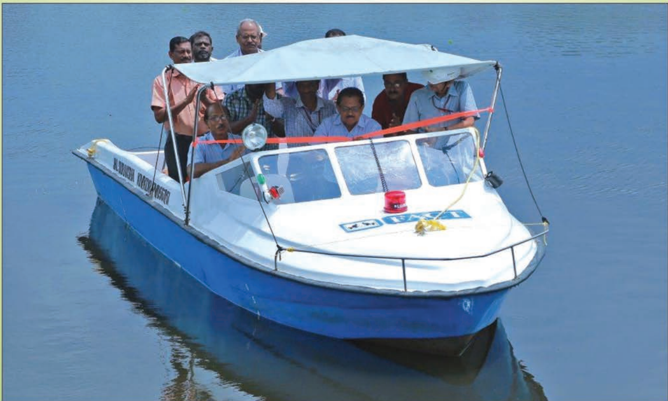
FACT has launched a new speed boat named 'JALSURAKSHA', for handling emergency situations in the inland waterways.