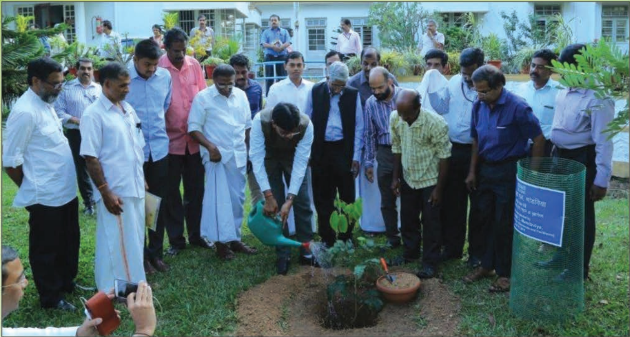
Shri Mansukh L Mandaviya, Minister of State for Shipping, Chemicals & Fertilizers, plants a sapling at FACT Corporate Office premises.