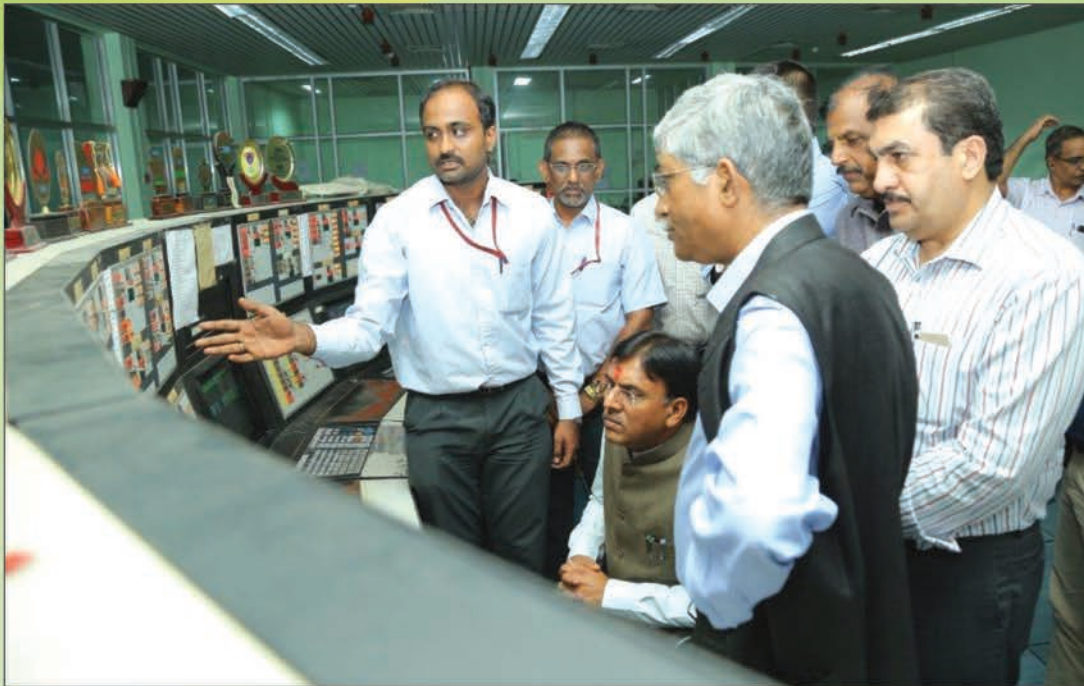
Shri Mansukh L Mandaviya, Minister of State for Shipping, Chemicals & Fertilizers, visits FACT Ammonia plant Control Room.