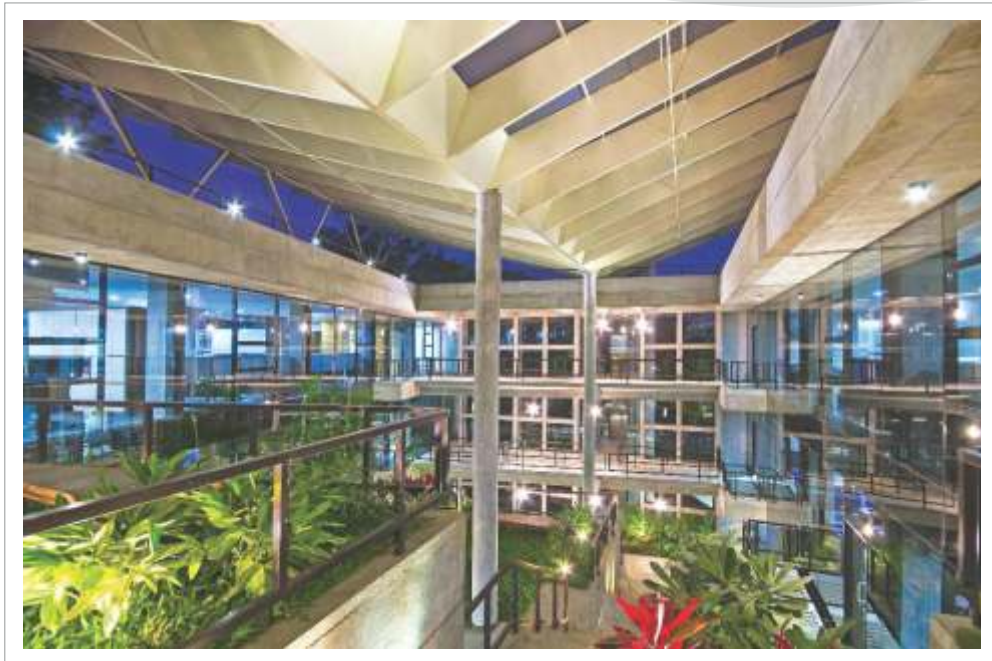
Atrium at Night