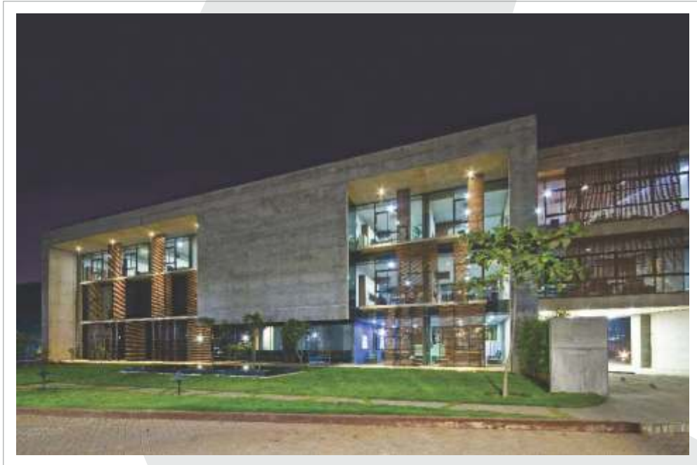
New Corporate Office Building at Night