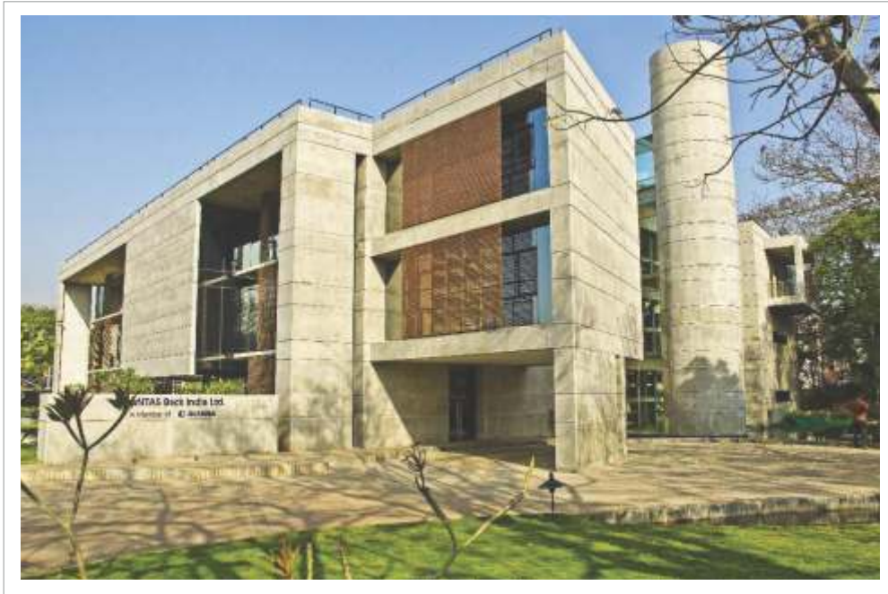
New Corporate Office Building at Pimpri