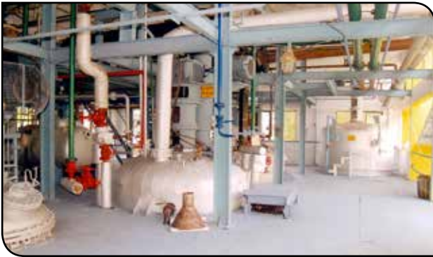
Resin Manufacturing Facility