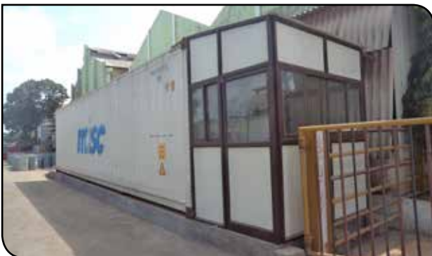
Refrigerated Warehouse for Sensitive Finished Goods