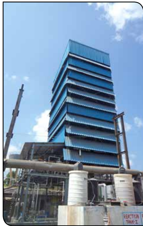
Phenol Recovery Plant