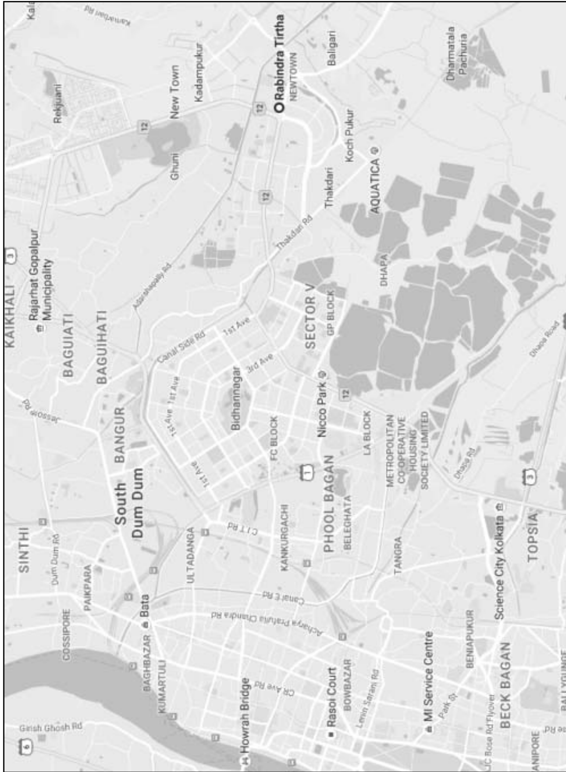
ROUTE MAP TO THE VENUE OF THE 112 TH ANNUAL GENERAL MEETING OF RASOI LIMITED

RABINDRA TIRTHA, 33-1111, MAJOR ARTERIAL ROAD, 3 RD ROTARY, NEW TOWN, KOLKATA - 700 156