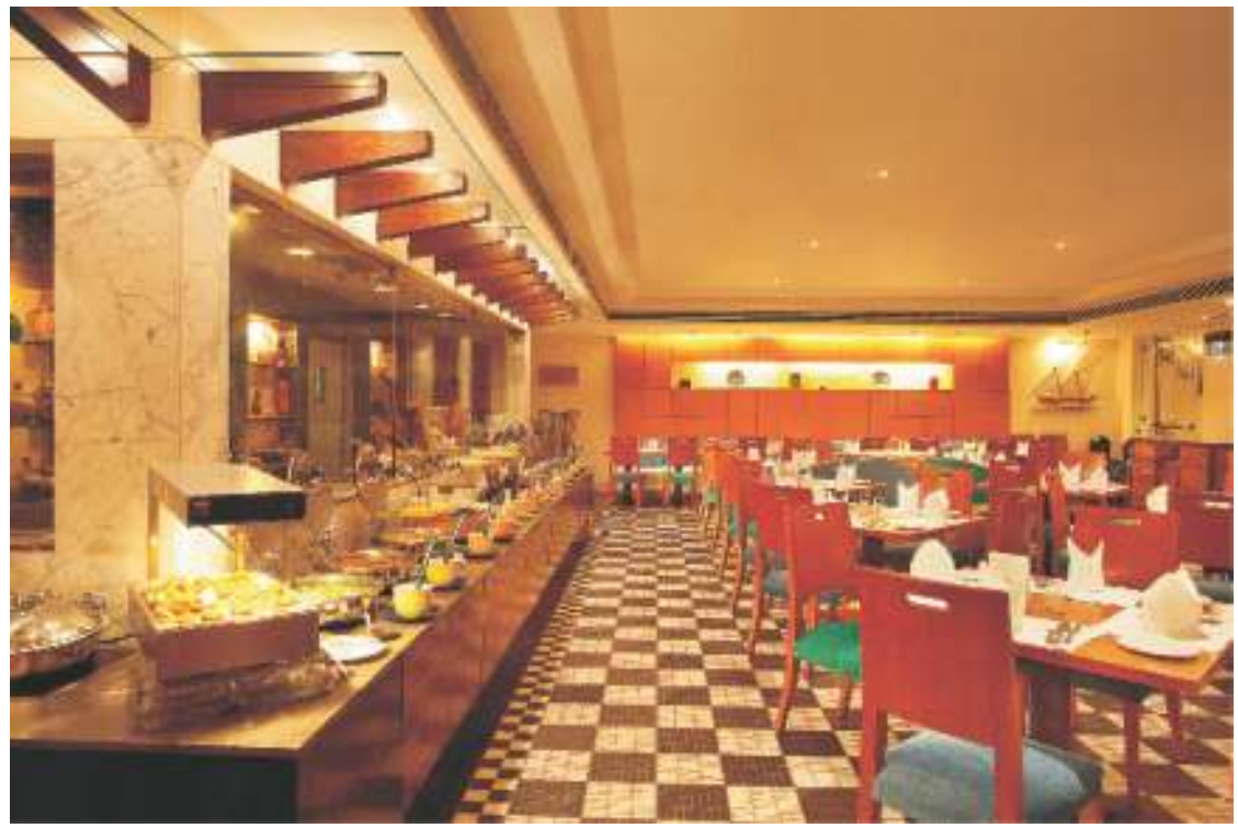
Cambay Pavilion - 24x7 Fine Dining restaurant