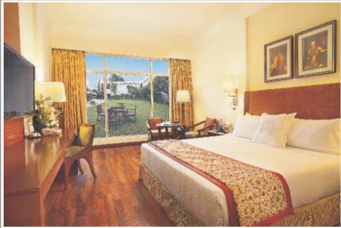
Executive Club Exclusive room