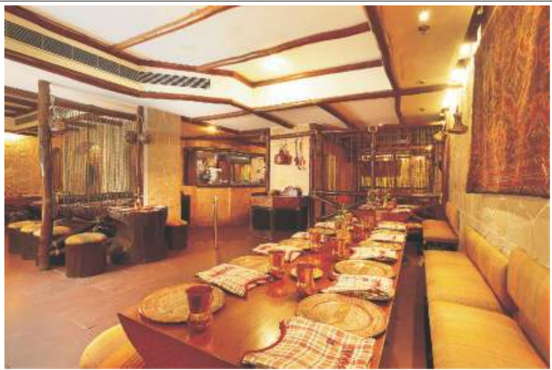
Peshawri - Speciality restaurant catering to North-West Frontier cuisine