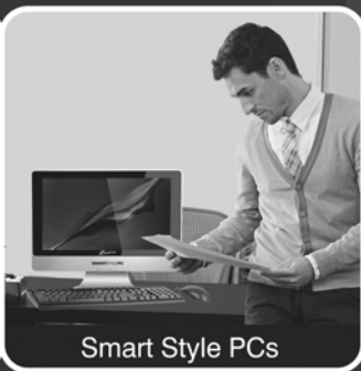
Smart Style PCs