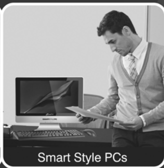
Smart Style PCs

Central Government for maintenance of cost records in respect of the Company's products under Section 209(1)(d) of the Companies Act, 1956, are broadly reviewed by us and we are of the opinion that prima facie, the prescribed accounts and records are maintained. We have not, however, made a detailed examination of the records, with a view to determining whether they are accurate or complete.