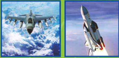
Defence & Aerospace