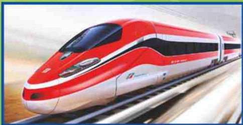
Automotive & Transportation