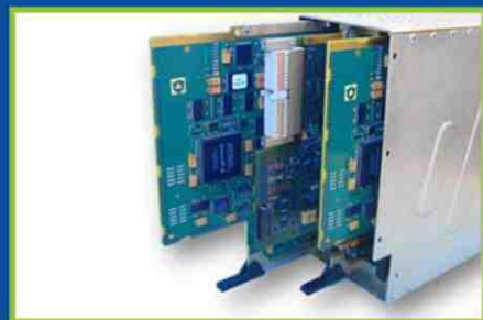
Built to Print (BTP)