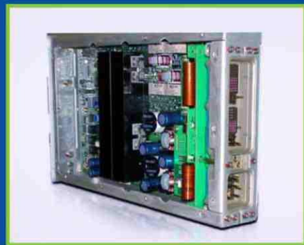
Built to Specification (BTS)