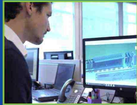
Design & Engineering services