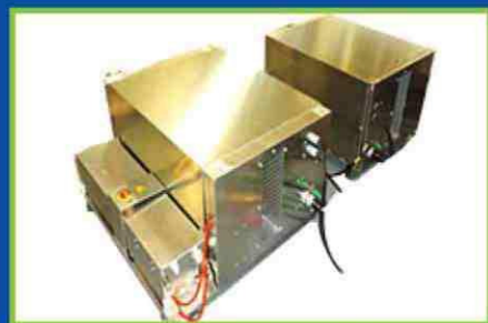
Built to Market (BTM)