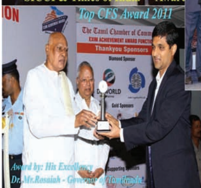
Award by: His Excellency Dr. Mr. Rosuiah - Governor of Tamilnadu