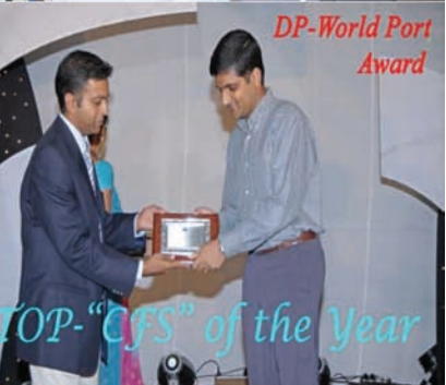
DP-World Port Award