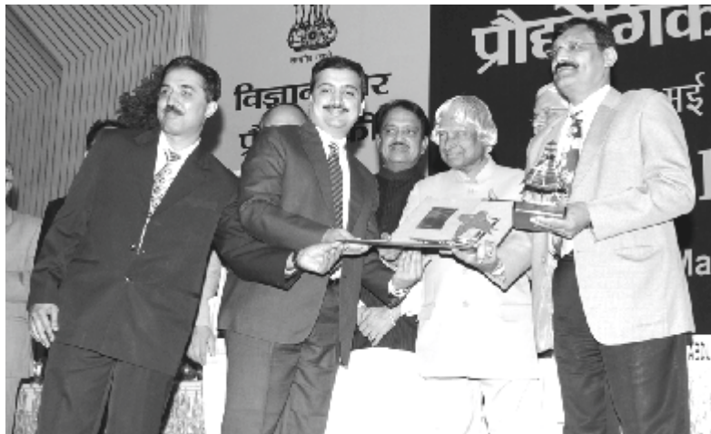
SGL received "National Award" for the Successful Development & Commercialization of Indigenous Technology by "Technology Development Board (Department of Science & Technology)", Government of India. The award was presented by former president of India Dr. A P J Abdul Kalam on Technology.