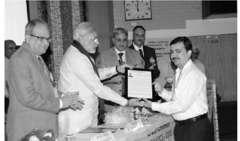
National Geomatics Award for Technology for 2009 to development of IGIS 1.0 from Chief Minister Mr. Narendra Modi. The award was conferred by Indian Society of Geomatics (ISG).