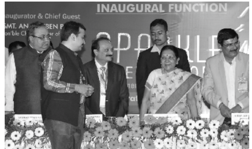
A GIS Portal launched by Hon. Chief Minister Smt. Anandiben Patel, Gujarat state, which is Developed by Scanpoint Geomatics Ltd. for Surat Municipal Corporation.