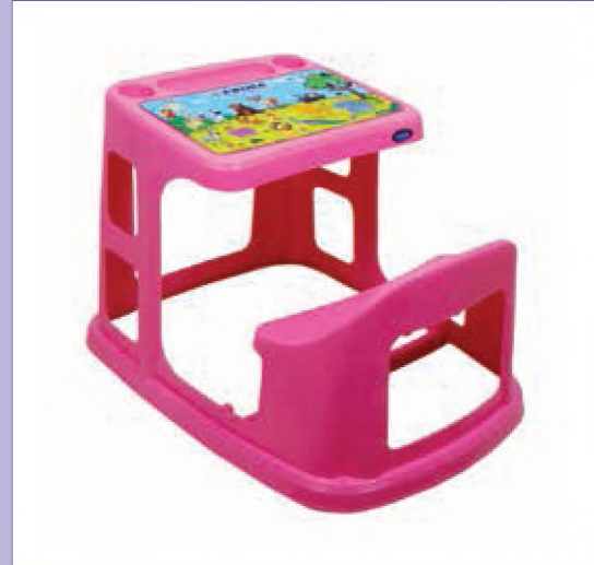
KIDS STUDY TABLE