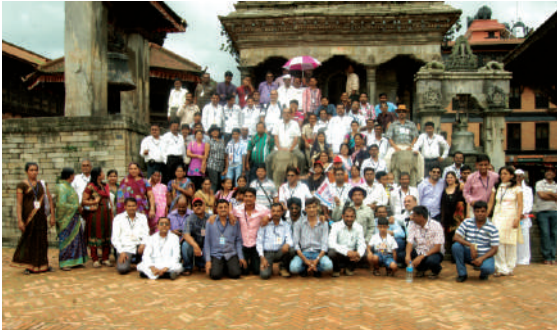
Tulsi Dealer & Staff special meeting in Nepal.