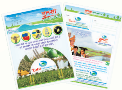
“Tulsi Jalniyojan Patra” Monthly Magazine for farmers, sharing information on farming technology & updates