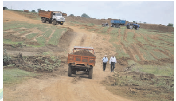
After Bhumi puja, Land development activity is going on for upcoming Mega project.