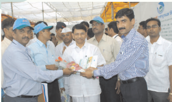
Shri Gulabrao Devkar, Minister of Govt. of Maharashtra at our Krishi Exhibition stall.