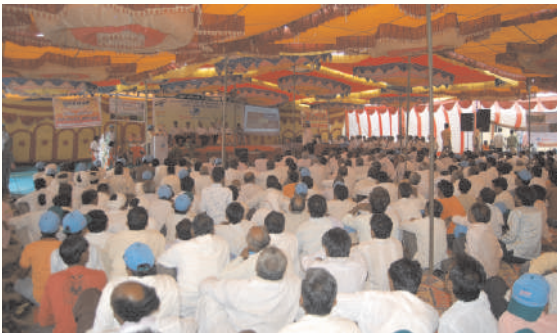
Farmers meet at Borgaon.