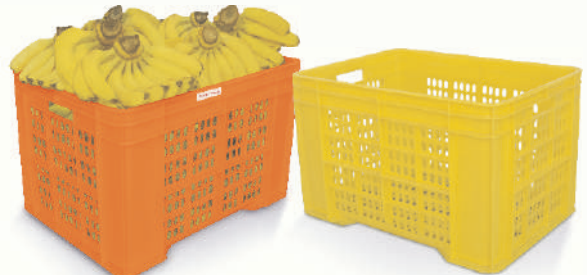
New Product “Banana Crate” Commercial Production started.