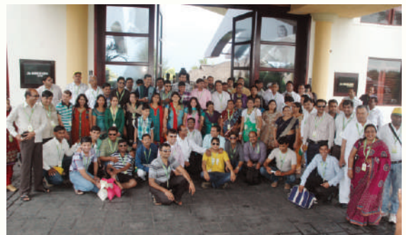
Tulsi Dealers Trip to Mauritius