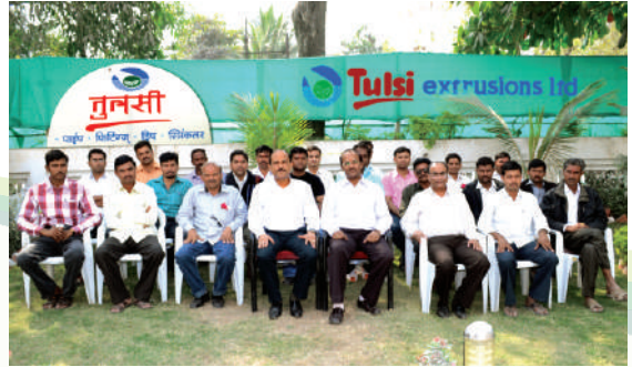
Tulsi Dealer Special meeting at Jalgaon plant.