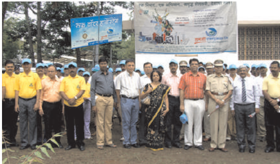
Some roof water harvesting project by Tulsi for social welfare & Awareness.