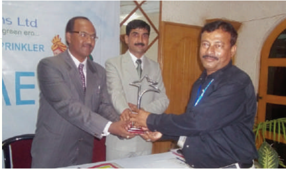
Tulsi Dealer Special meeting in Jagannath Puri.