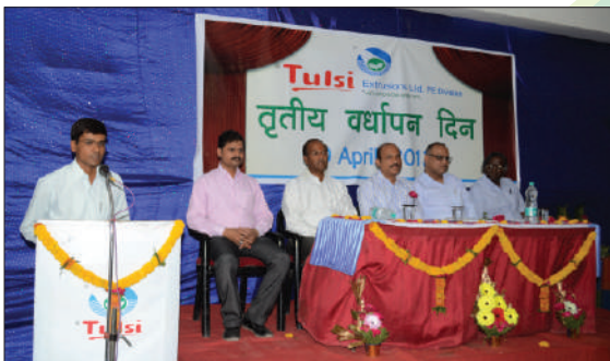
Annul day celebration of Unit - 2 Plant