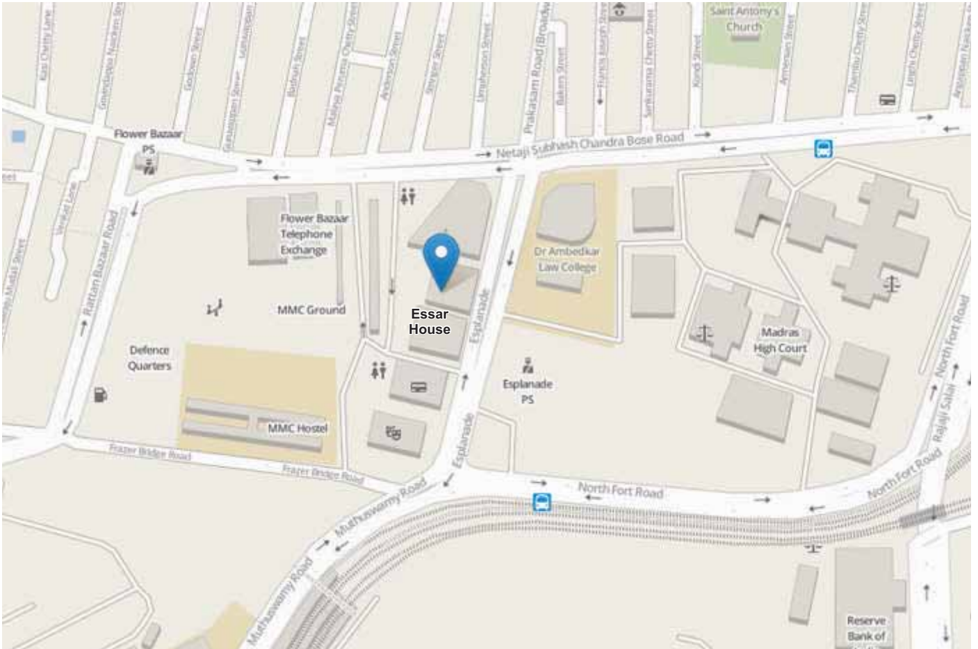
Route map to AGM Venue