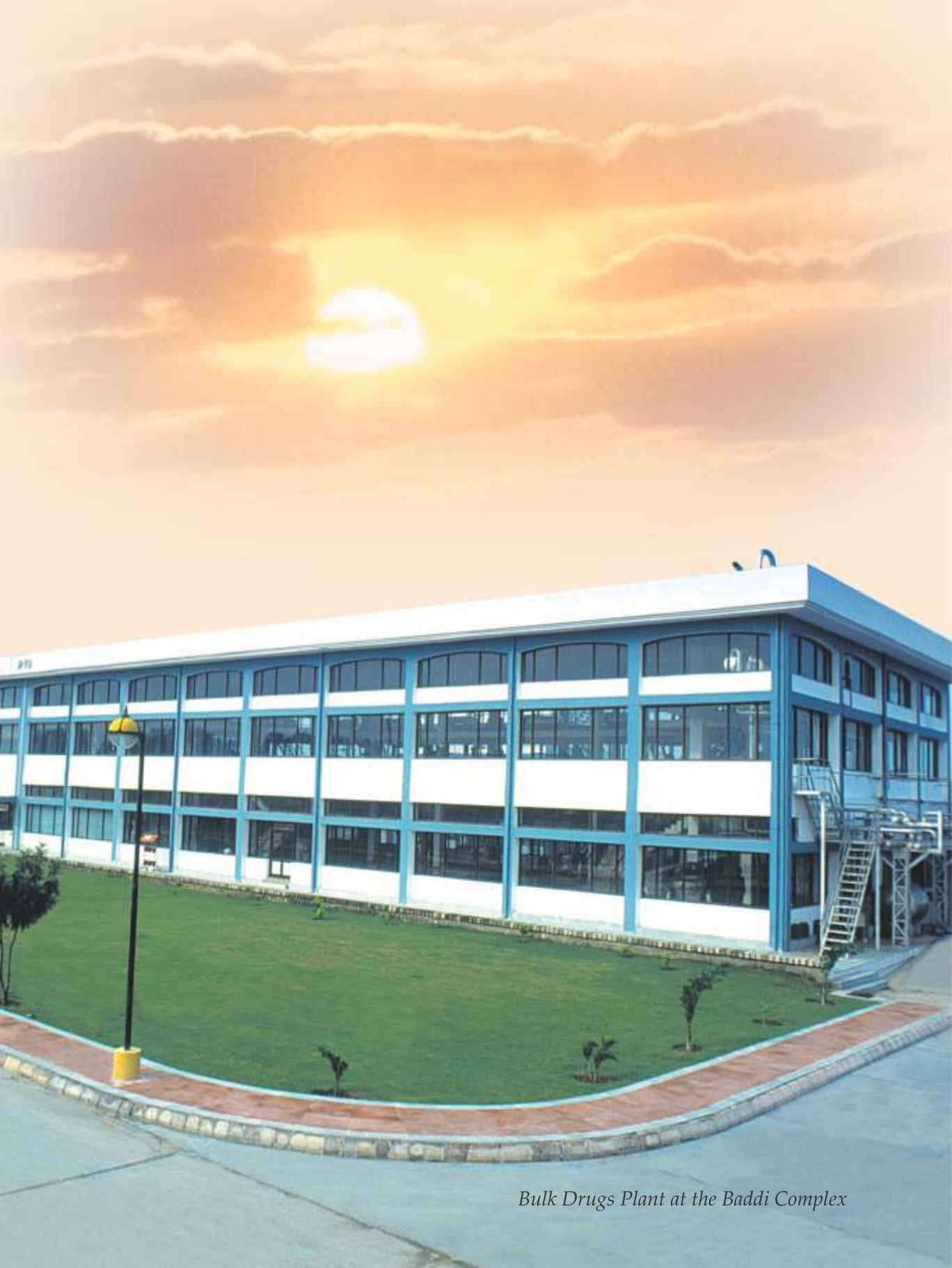
Bulk Drugs Plant at the Baddi Complex