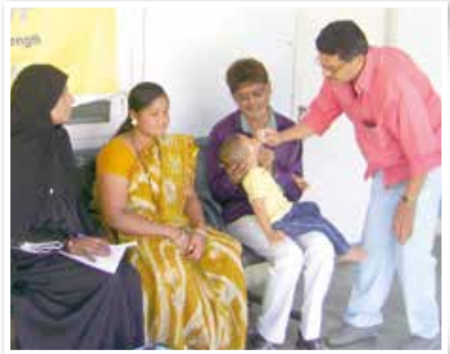
▼ Pulse polio camp