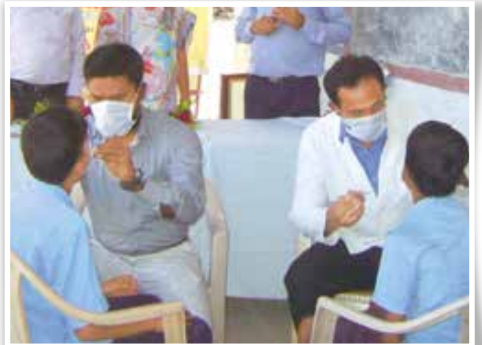
▲ Dental check-up camp