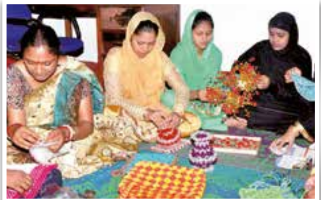
▼ Handicraft training