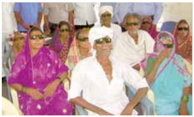
▲ Eye camp