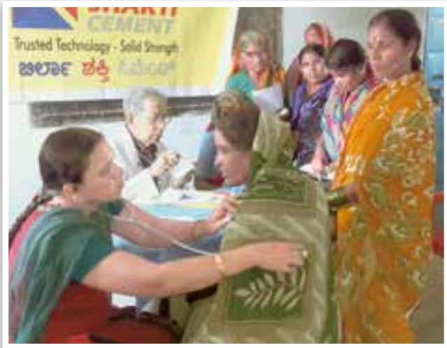
◀ Health check-up camp