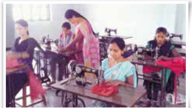
▲ Tailoring training