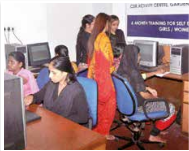
◀ Computer training