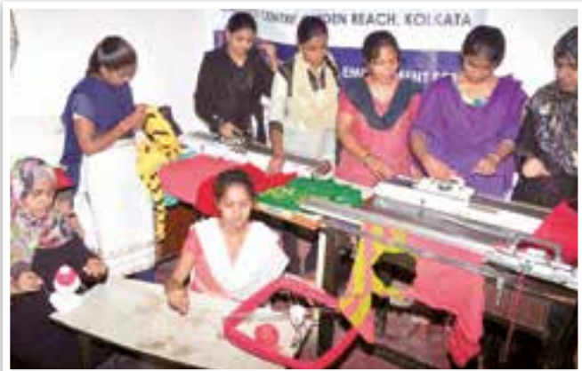
▲ Knitting training