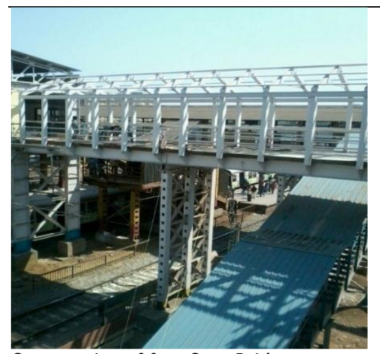
Construction of foot Over Bridge