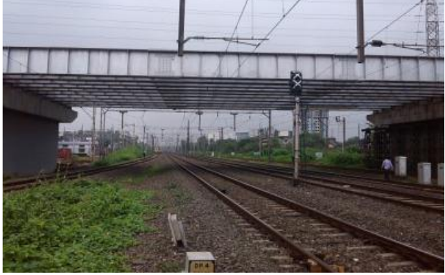
Construction of Road Over Bridge