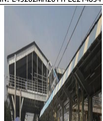
Construction of FOB's, Booking Office & Platform