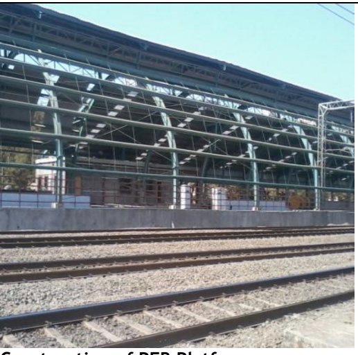
Construction of PEB Platform