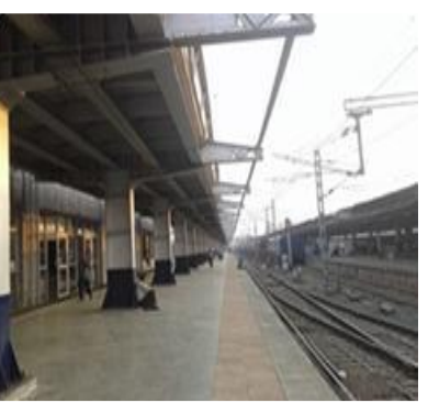
Construction of platform along with Pit lines