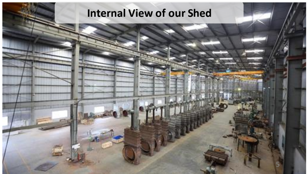
Internal View of our Shed

The Heavy Shed is Equipped with 6 EOT Cranes with up to 20 Tonnes Lift Capacity and a Height of 53 Feet which enables us to undertake Fabrication of Large Sized Jobs.