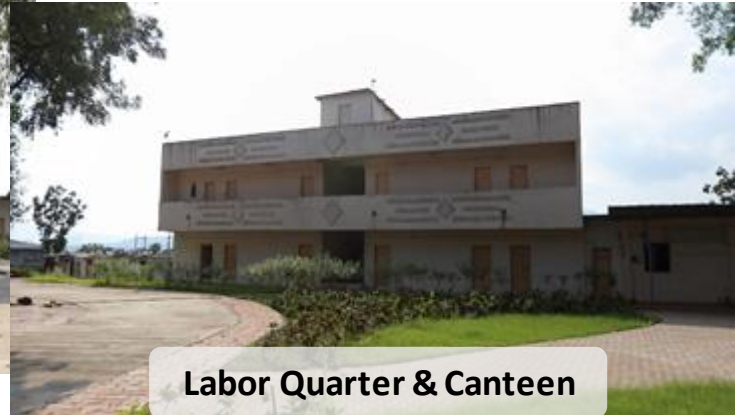
Labor Quarter & Canteen