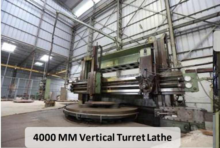
4000 MM Vertical Turret Lathe