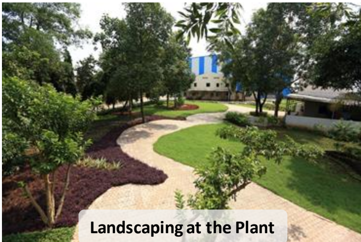
Landscaping at the Plant