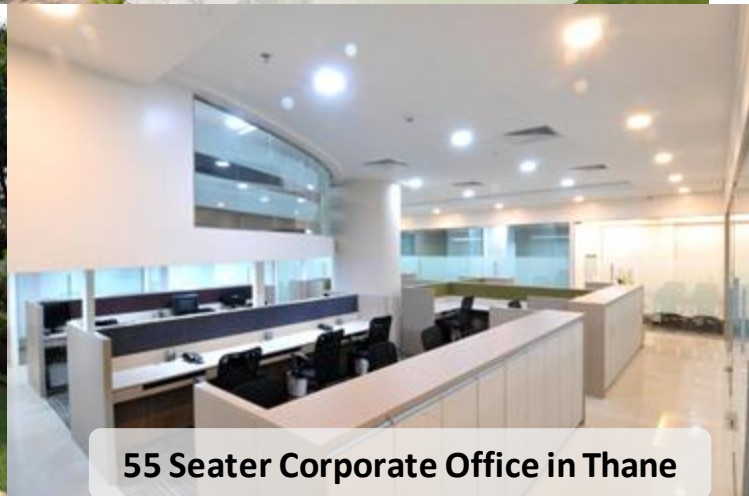
55 Seater Corporate Office in Thane