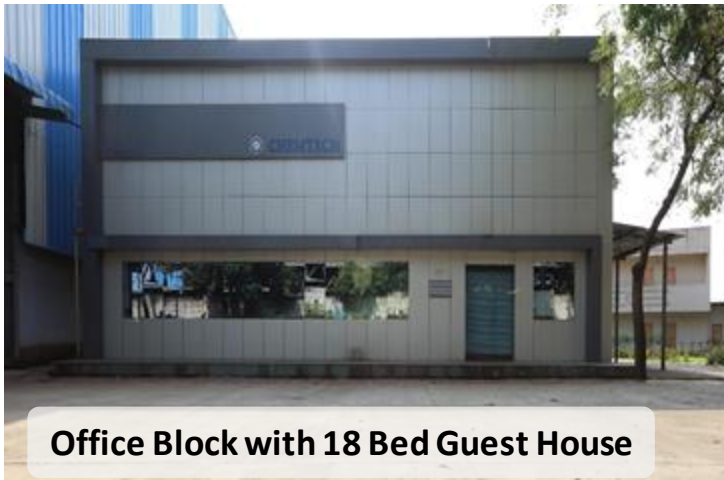
Office Block with 18 Bed Guest House