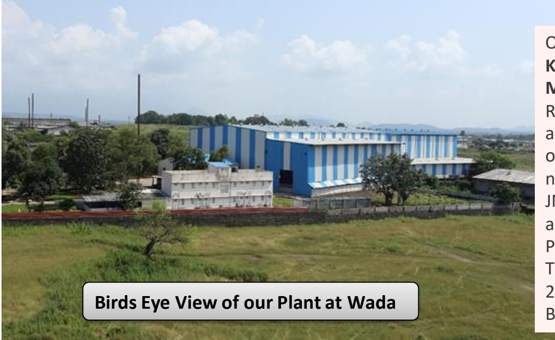
Birds Eye View of our Plant at Wada

Our Plant is Located at Kudus, 55 km from Mumbai . The nearest Rail Head is at Kalyan, around 40 kms from our Plant and the nearest Sea Port is JNPT Port, which is around 75 km from our Plant and the nearest Truck terminal is just 20 km away at Bhiwandi.