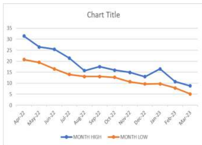
BSE Price Chart