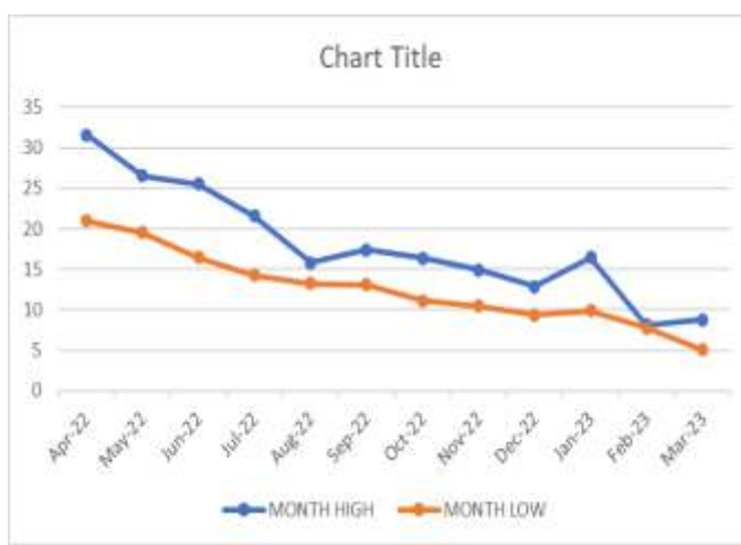
NSE Price Chart