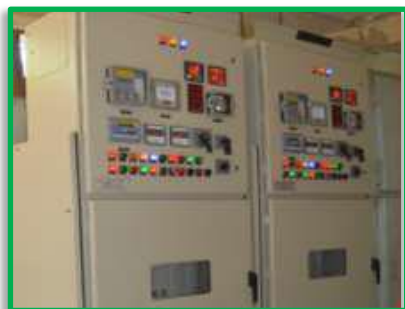
Indoor MV Switchgears upto 33 kV