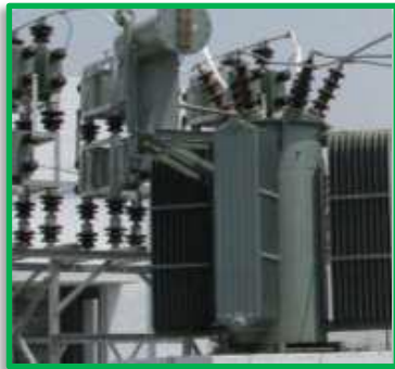
HT Passive Harmonic Filters

Our manufacturing unit is located at Vasai in Maharashtra. Our manufacturing facility is equipped with requisite infrastructure including machinery, other handling equipment to facilitate smooth manufacturing process. We endeavour to maintain safety in our premises by adhering to key safety norms. Our manufacturing process is integrated from procurement of raw materials to final testing. We believe in manufacturing and delivering quality products and are dedicated towards supply of quality products by controlling the procurement of standard raw material, monitoring the process parameters, maintaining appropriate measures to manage hazardous materials and to comply with applicable statutory and regulatory requirements of our products. It is the diligent efforts of our personnel, that we have been able to streamline our business operations.