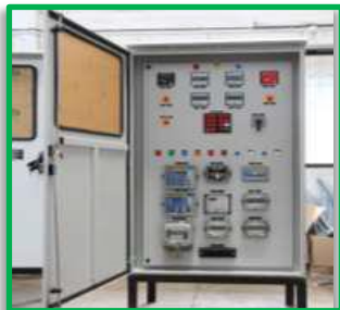
Control and Relay Panels