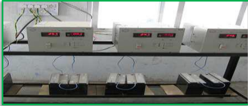
Battery and Battery Chargers