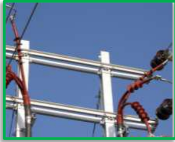
Cable termination kits, insulating sleeves, shrouds etc.