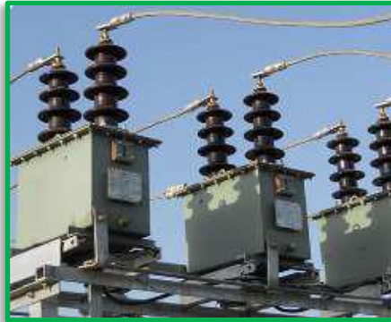
MV Current and Voltage Transformer upto 33 kV