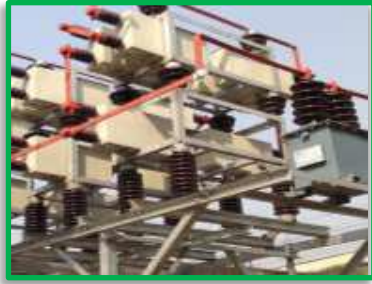
HT Capacitor banks of voltage levels from 3.3 kV to 132 kV