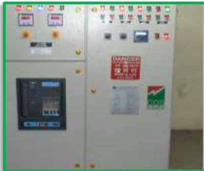
LT APFC (Automatic Power Factor Control) panels with contactor-based switching