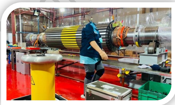
Overseas Consultation for 54 MW Turbo Generator site rewinding