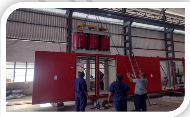
Overhaul of Dry Type Transformer