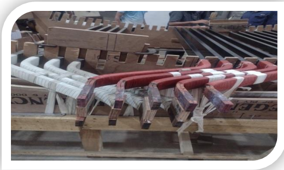
Manufacture of 80 MW Hydro Generator Coils