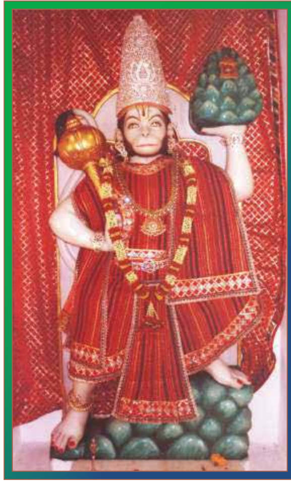
A glimpse of the Hanuman Mandir at Joonktollee Tea Estate, Assam