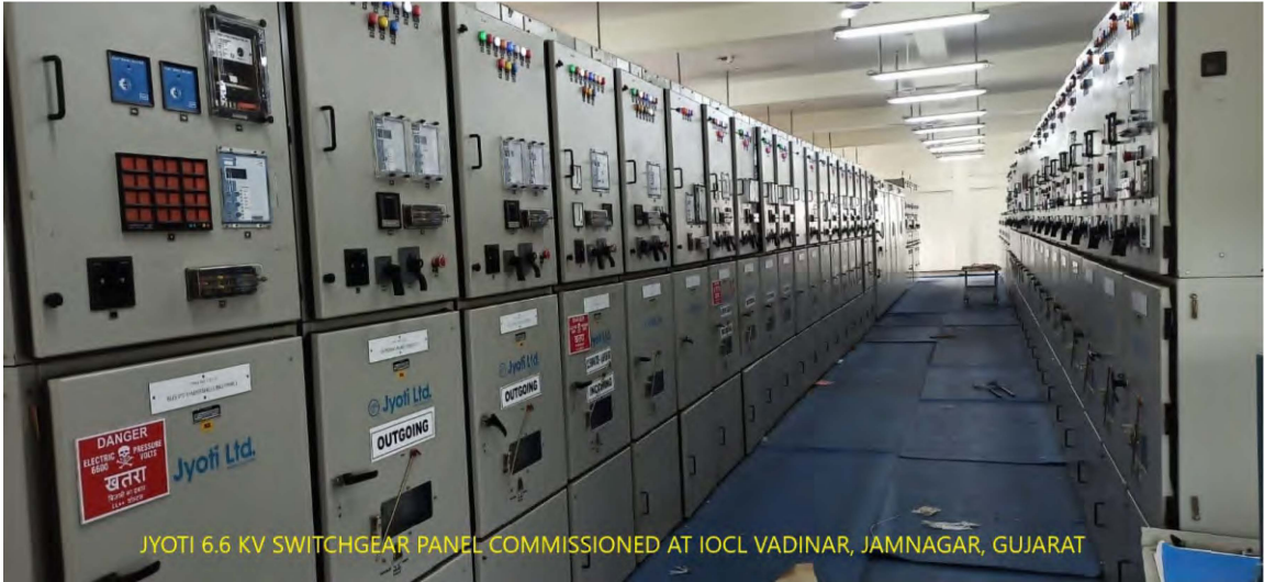
JYOTI 6.6 KV SWITCHGEAR PANEL COMMISSIONED AT IOCL VADINAR, JAMNAGAR, GUJARAT