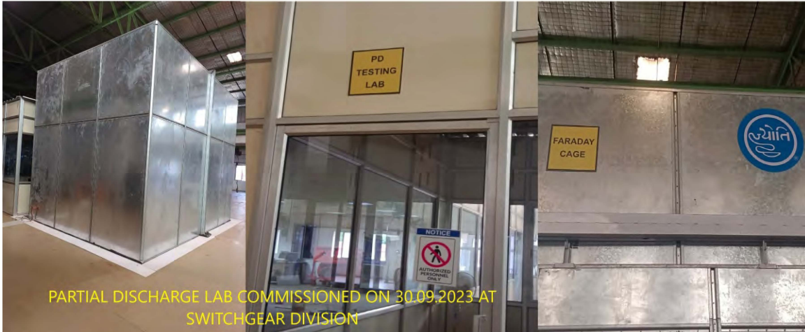
PARTIAL DISCHARGE LAB COMMISSIONED ON 30.09.2023 AT SWITCHGEAR DIVISION