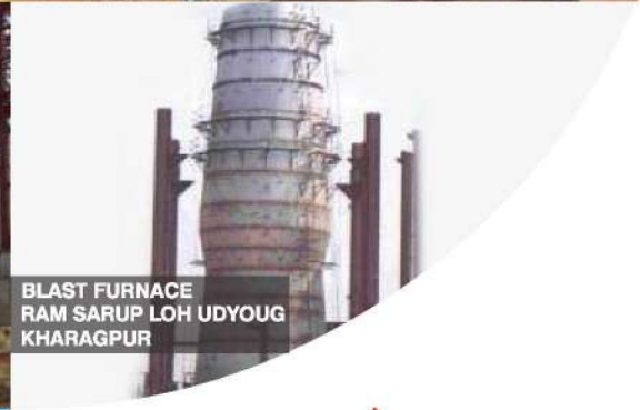
BLAST FURNACE RAM SARUP LOH UDYOG KHARAGPUR