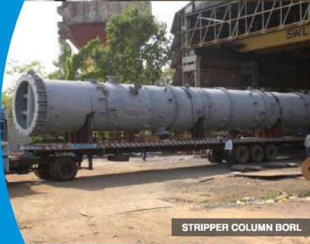
STRIPPER COLUMN BORL