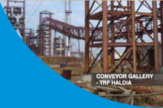
CONVEYOR GALLERY - TRF HALDIA