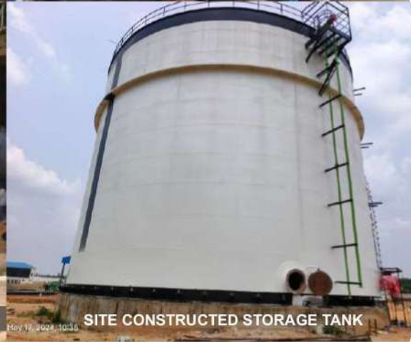
SITE CONSTRUCTED STORAGE TANK