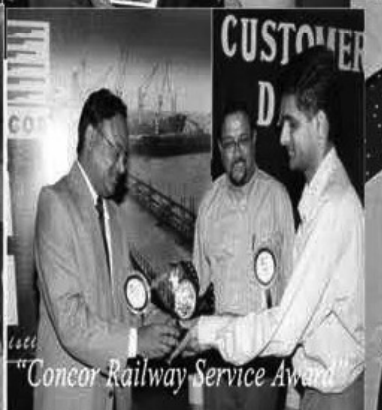
"Concor Railway Service Award"