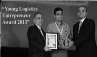
"Young Logistics Entrepreneur Award 2013"