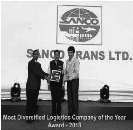
Most Diversified Logistics Company of the Year Award - 2018