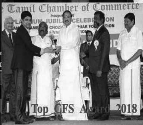
Top CFS Award 2018