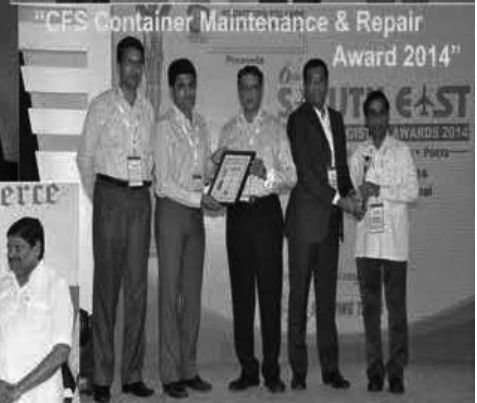
"CFS Container Maintenance & Repair Award 2014"