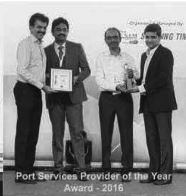
Port Services Provider of the Year Award - 2016