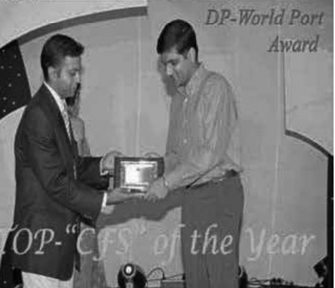
TOP-"CFS" of the Year