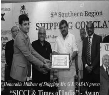
Honorable Minister of Shipping Mr. G. K. VASAN presents "SICCI & Times of India" - Award