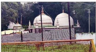
SC said without its nod, no action should be taken on the survey

Ashish Goyal of Hindu Front for Justice (HFJ), whose petition in the HC led to the survey, told TOI, "The report contains details of nearly 1,700 archaeological re-