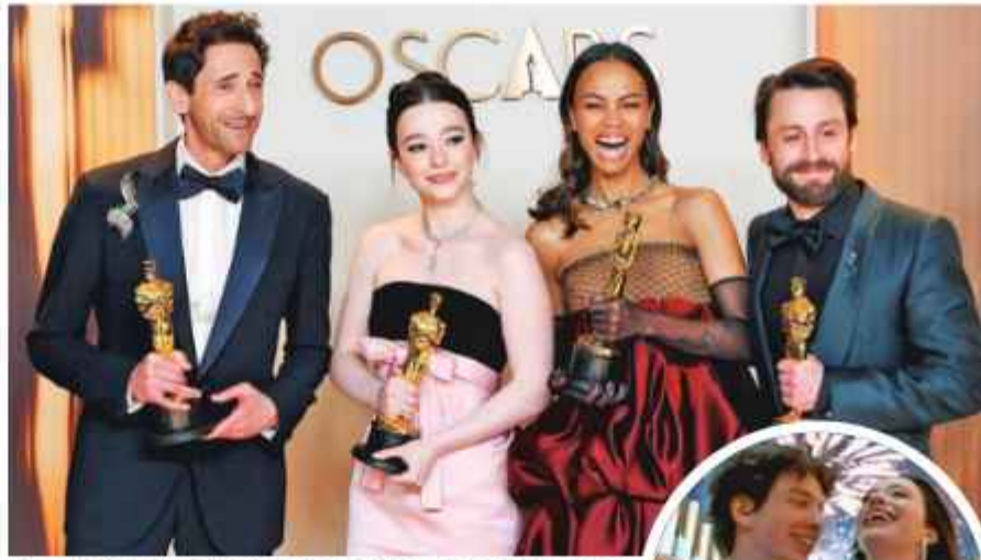
(From left) Adrien Brody, Mikey Madison, Zoe Saldana, and Kieran Culkin after winning Oscar awards at the 97th Academy Awards in California on Monday