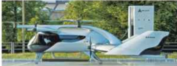
ePlane air taxi with vertivolt charger

IndiGo's parent company, InterGlobe Enterprises, too has been looking to develop necessary eVTOL infrastructure in collaboration with American air taxi manufacturer Archer Aviation. Elsewhere in the world, Dubai has approved the construction of its first aerial