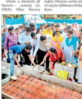
বিমানবন্দর রাস্তার মেরামতির কাজে সন্টলে ১৩টি কমেটোর সন্টলের কাজ শুরু হয়েছে।

পুলিশের ৩১১ নম্বর হাটের। গত শুক্রবার পুলিশের একটি টিমের নেতৃত্বে সন্টলে ১৩টি কমেটোর সন্টলের কাজ শুরু হয়েছে। সন্টলে ১৩টি কমেটোর সন্টলের কাজ শুরু হয়েছে। সন্টলে ১৩টি কমেটোর সন্টলের কাজ শুরু হয়েছে।