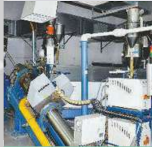
550 kV Maillefer HVCV Insulate Line