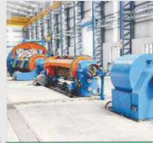
DT Armouring Machines