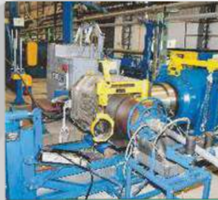
Lead Sheathing Line