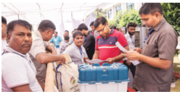
Polling officials check EVMs in Sonipat on Friday.

In the 2024 Lok Sabha polls, the smaller parties were decimated. The BJP and the