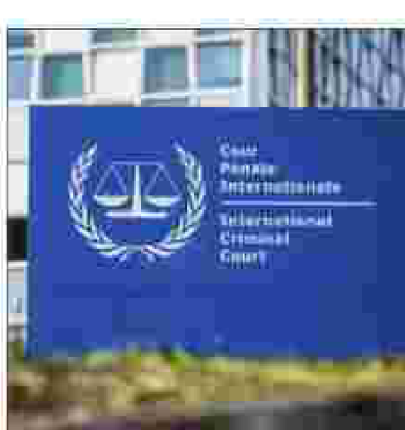
Neither Washington nor Tel Aviv is

The order Trump signed Thursday accuses the ICC of engaging in "illegitimate and baseless actions ally Israel" and of abusing its power by issuing "baseless arrest and former Israeli defence minister Yoav Gallant, "The ICC has no ster Benjamin Netanyahu for alle- jurisdiction over the United Staged war crimes over his military tes or Israel," the order states, aderous precedent' with its actions Trump's action came as Netanynians, including children, have ahu was visiting Washington, He been killed during the Israeli miliand Trump held talks Tuesday at