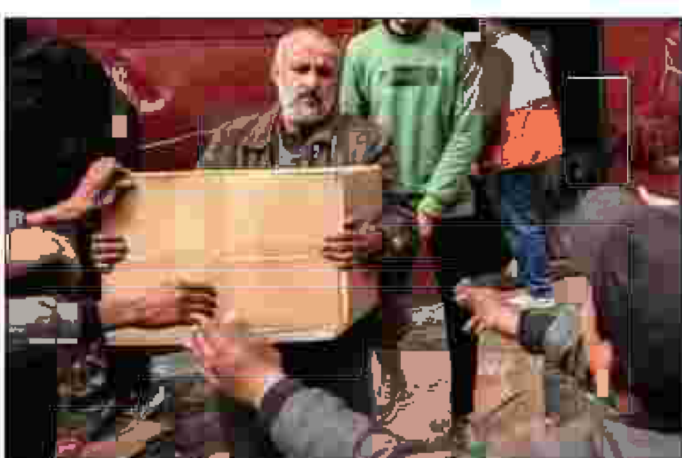
Relief supplies being distributed in Figure rn Gaza, Friday

Gaza City, Gaza: Palestinians in Gaza say they are deter mined to rebuild their own seafront restaurants and hotels, dismissing US President Donald Trump's vision of creating a "Riviera of the Middle East" emptied of its population and under US control_