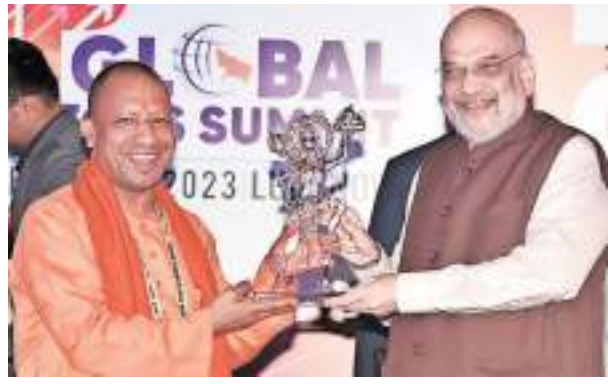
Uttar Pradesh Chief Minister Yogi Adityanath with Union Home Minister Amit Shah at a session of the summit in Lucknow on Friday.