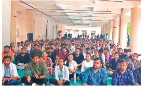
BJ Medical College medicos during a protest on Monday.

It said, "In a meeting with the Health Minister on July 9, 2024, we were assured of a 40% increase in stipend. So the movement was postponed by trusting the demo-