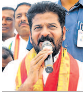
An internal probe was ordered soon after the formation of the new Congress government under A Revanth Reddy.

HYDERABAD: The Special Intelligence Bureau (SIB) of the Telangana Police tapped mobile phones of around 1,200 people, including political leaders, social activists, members of student organisations, business people, judges, lawyers and journalists during the previous Bharat Rashtra Samithi (BRS) regime headed by K Chandrasekhar Rao, a suspended deputy superintendent of police has confessed to the police.