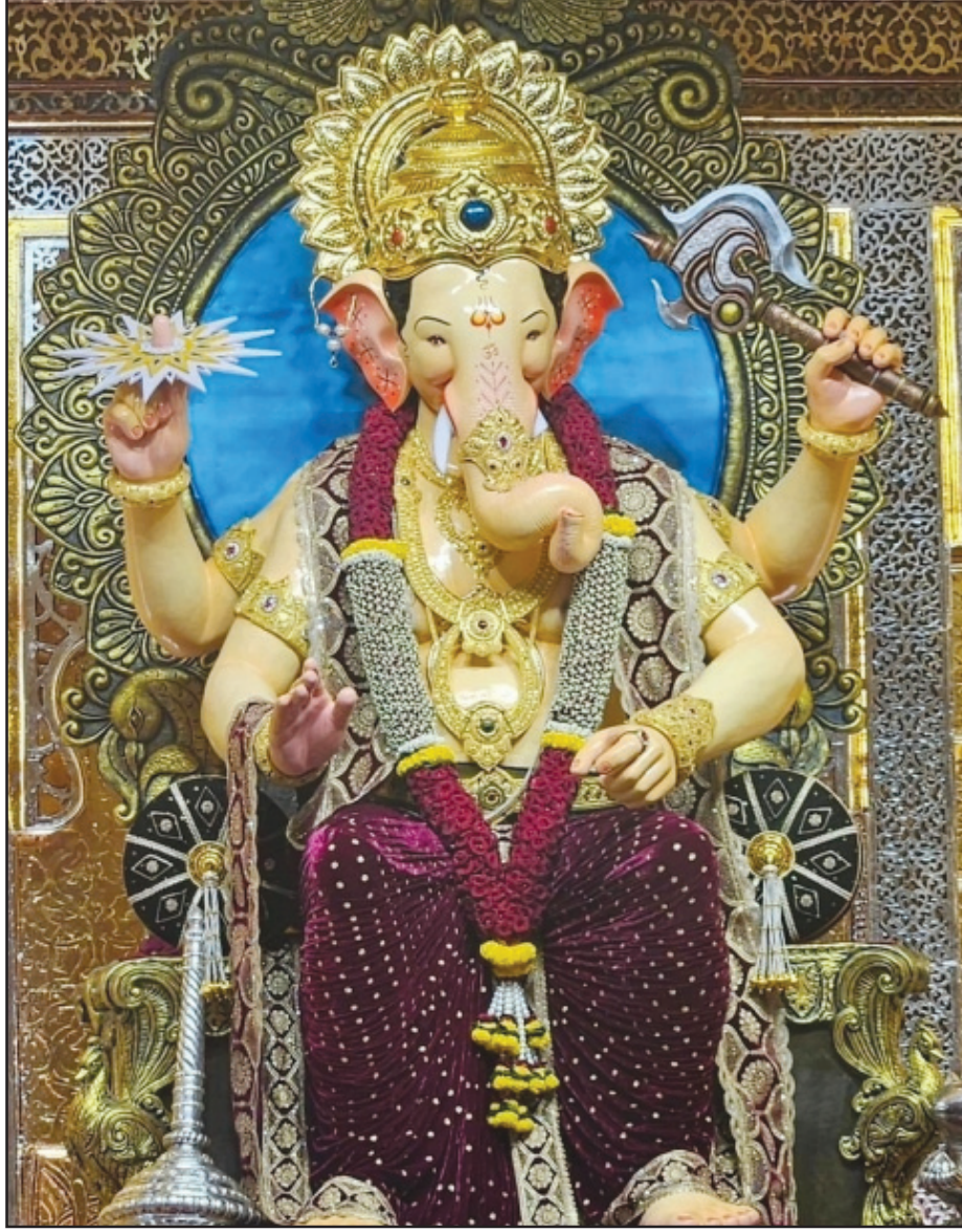
Mumbai's Lalbaugcha Raja was unveiled ahead of Ganesh Chaturthi.

In his greeting message, the Chief Minister said that the arrival of Lord Ganesha every year brings a new energy, inspiration and enthusiasm. This creates an auspicious, holy atmosphere. Ganeshotsav shows the culture of Maharashtra. Therefore, the world is also paying attention to Maharashtra. Shri Ganesha is considered Kaladhipati." Therefore, during this festival, creativity also flourishes. Every corner of Maharashtra overflows with such innovations and enthusiasm. Let us celebrate this festival with enthusiasm, joy and sanctity this year too," he said. "While serving Lord Ganesha with spirit, let us be conscious of social responsibility. Taking the festival as an opportunity, let us reach out to the needy in the society and try to provide them with education, health and various types of services and help," he noted.