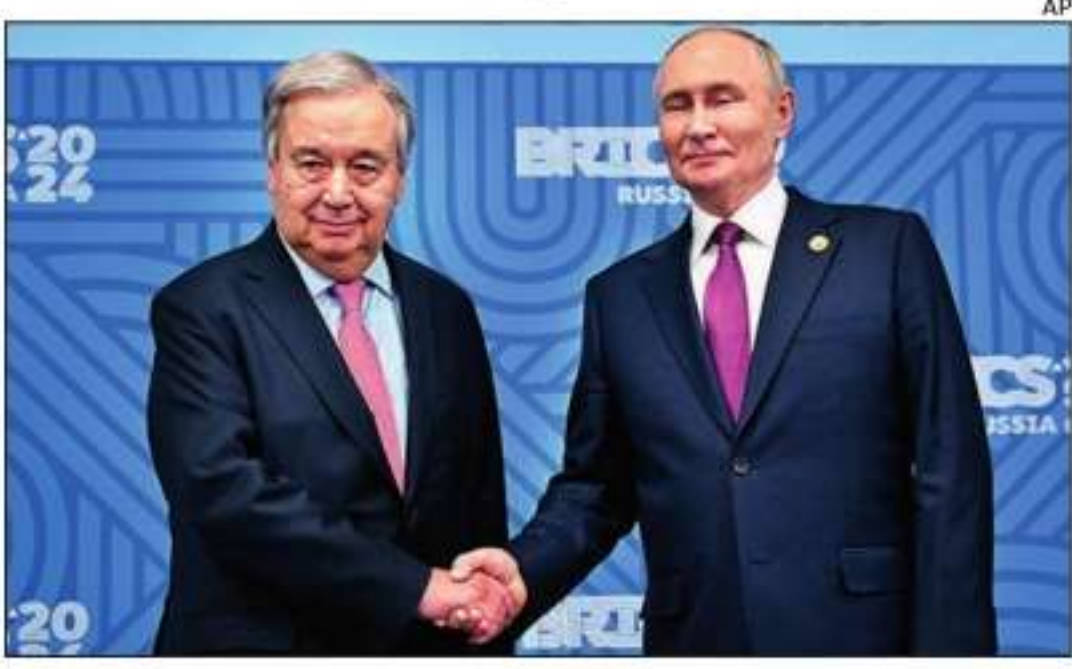
Putin with UN chief Antonio Guterres in Kazan, Russia, on Thursday

Russia has been conducting a ferocious summer campaign along the eastern front in Ukraine, gradually compelling Kyiv to surrender ground. But Russia has