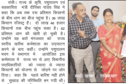
मंत्रालय में कृषि मंत्री के अध्यक्षता में मंत्रियों की बैठक।

एफपीओ व जेएमएम पीटल लांव, 15 लाख का चेक व रजिस्ट्रार का प्रमाण पत्र सौंपा