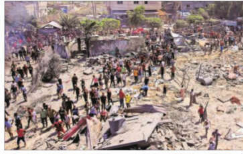
Palestinians inspect the site hit by an Israeli bombardment on Khan Younis, southern Gaza Strip, on July 13, 2024.

Hamas neither confirmed nor denied the killing of Deif, but one official, Ezzat