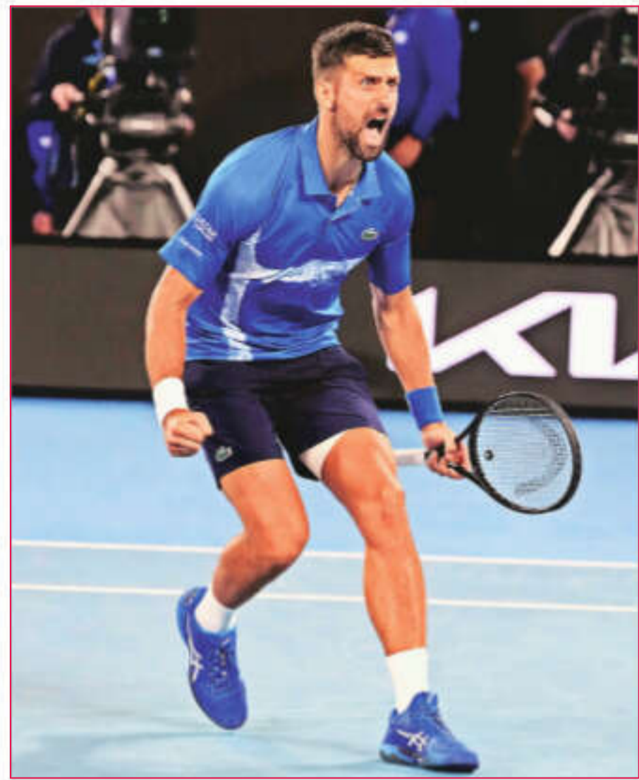
Novak Djokovic beat young rival Carlos Alcaraz 4-6 6-4 6-3 6-4 in a battle worthy of a title clash to charge into the Australian Open semi-finals on Tuesday...