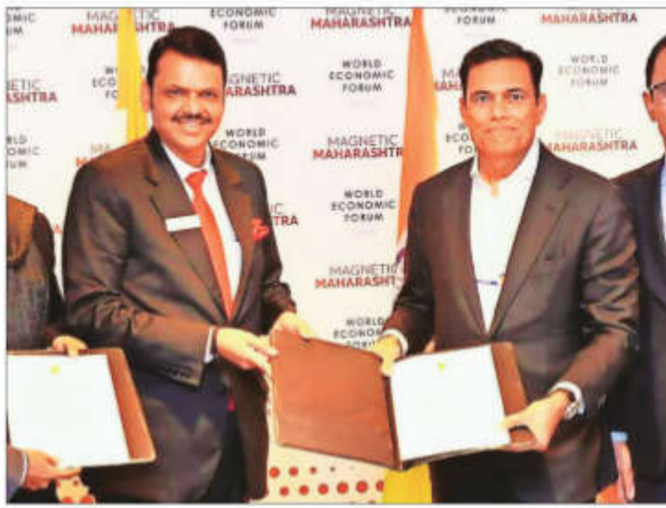
Maharashtra chief minister Devendra Fadnavis (left) and JSW Group chairman Sajjan Jindal signed an MoU at the 55th annual WEF meeting, in Davos on Tuesday